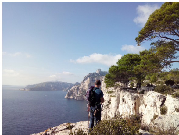
FIGURE 2 – Rock climbing (Claeys, 2015).

The attribution of merit to some activities occurred at the expense of other, less demanding activities, like tourist boating (Figure 4), picnicking and sunbathing. The allegedly “good uses” (Massena-Gourc, 1994) of the park had a relationship with nature that was primarily ascetic and contemplative (Figure 5) (Fabiani, 2001). The fact that this category was comprised almost exclusively of activities enjoyed by individuals of middle and