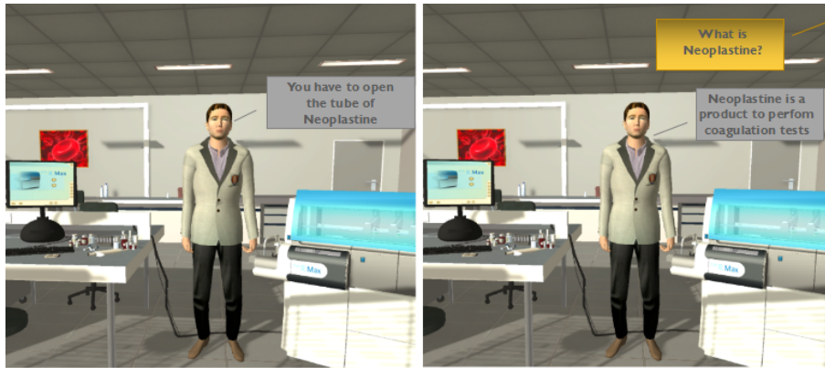
Fig. 3. Screen-shots from the blood analysis procedure

A first application was developed and will integrate the behavior described in the section 3. It is an informed virtual environment for procedural learning for blood analysis. The procedures to learn involve actions on the automaton and the reagents preparation. Figure 3 contains two screen-shots taken from this application. In those two pictures the virtual tutor (from the Greta platform) is placed in the middle of the scene. The procedure involves actions applied on the automaton that is positioned at its left (like turning on the machine, opening the drawer, etc.) and actions to prepare the reagents that are at the agent's right, on the bench (like vials, test tubes, etc.). In the left picture, the virtual tutor informs about the first action to perform. In the picture on the right, the learner asks for more information about the object to manipulate (Neoplastine). Through its communication behavior, the virtual agent interprets this question and, using its knowledge about the environment, describes the object.