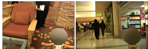
Figure 7. Two examples that do not agree with the rule that classifies images as without color cast when the angle of the estimated illuminant is below 10^\circ . The values of the estimated angles are, respectively, 7.38^\circ and 5.59^\circ .

In general, we observed that for most of the images with color cast the angle is above 10^\circ while below this threshold most of the images are free of color cast. Some exceptions to this rule can be observed in Figure 7 and shall be the subject of further research. The result in Figure 7-left may be due to the presence in the scene of both natural and artificial illumination.