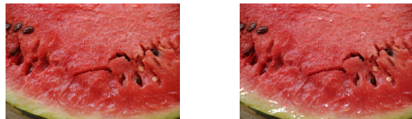
Figure 2. Left: original “watermelon” image taken under daylight. Right: connected regions of white reference. In spite of the fact that the image is characterized by a dominant color, there is enough contrast to let our algorithm detect white reference regions with a deviation angle with respect to the achromatic axis of 7.45^\circ , below the threshold \alpha = 10^\circ . Thus, the image is correctly characterized as not being affected by color cast.

The similarity between the estimated illuminant and the true value provided by the database was tested by computing the angular differences between both angles. The results are displayed in Table 1 and Figure 5 and they show that for 60% of the images the difference between the estimated value and the actual one is small (less than 4.75^\circ ), and only for 10% of the images the difference