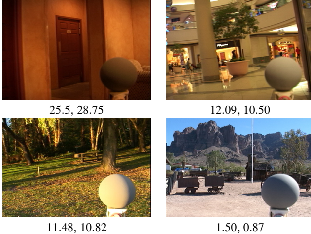
Figure 4. Examples of indoor images (top row) with strong (left) and weak (right) color cast. In the latter case both natural and artificial illumination are present in the scene. Bottom row, outdoor images with (left) and without color cast (right). In this case the color cast is due to the sunset light. The number below each image are, respectively, the angle between the given illuminant and the achromatic axis and the angle between the estimated illuminant and the achromatic axis. The values are similar in all cases. Moreover, we observe that higher values of the angle correspond to images with stronger color cast.