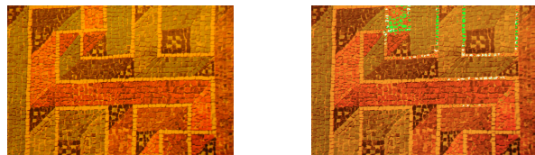
Figure 3. Left: original “Ravenna mosaic” image taken under unknown yellow illuminant. Right: connected regions of white reference. The angular deviation from the achromatic axis is 37.21^\circ , much above the threshold \alpha = 10^\circ . Thus, the image is correctly identified as being affected by color cast.