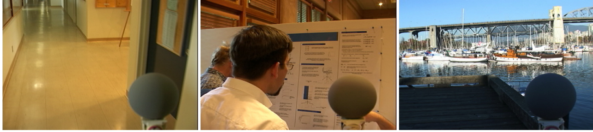
Figure 6. Three examples where the estimated illuminant differs considerably from the “true” value furnished by the Ciurea’s Dataset [1]. See text for comments.

analysis and processing of color images and video sequences. He has coauthored the book ‘A Theory of shape identification’ (Springer LNM, 2008).