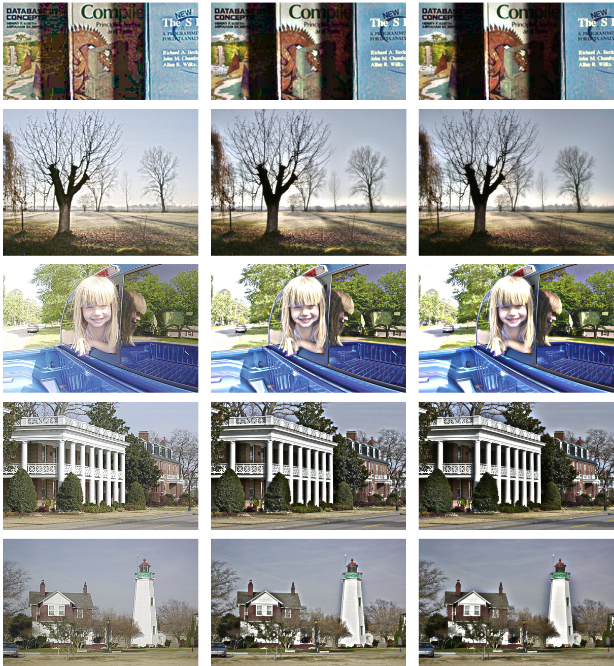
Fig 5 Output of SLMRACE with different kernel sizes s Left: s = 5 \times 5 . Middle: s = 25 \times 25 . Right: s = 50 \times 50 .