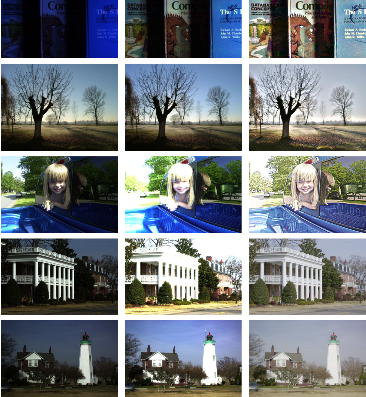
Fig 4 Left : original image. Middle : output of SLMRSR. Right : output of SLMRACE with a slope \alpha = 2 and a number of spray pixel n equal to the integer part of the image diagonal of each image.