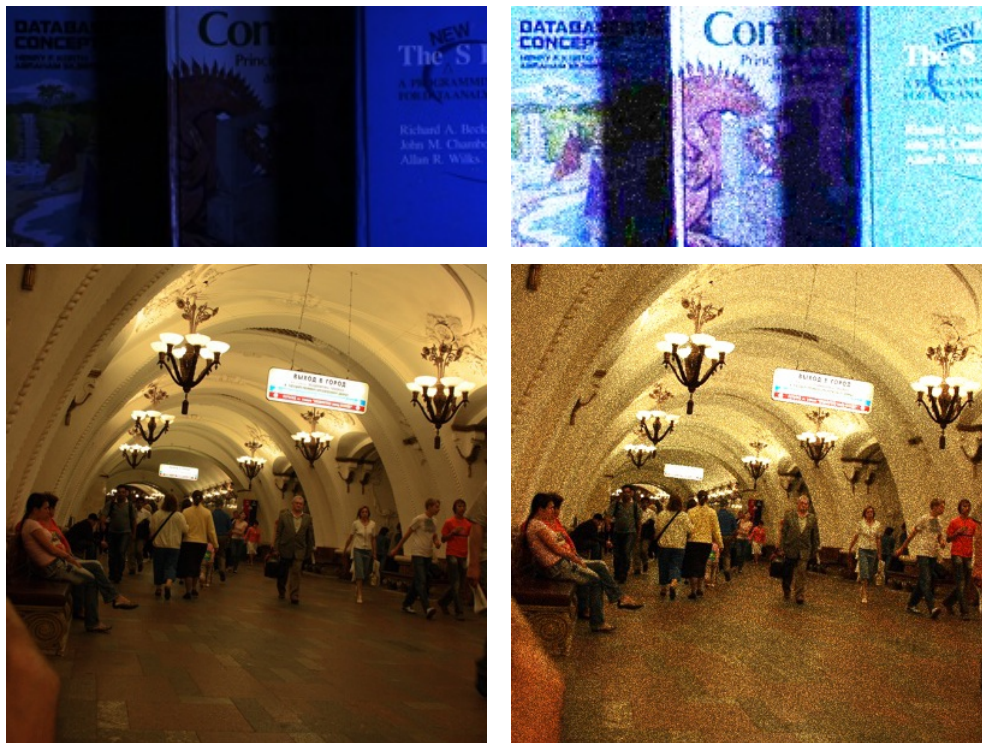
Fig 2 Left : original image. Right : output of RSR with N = 4 sprays and n = 5 pixels per spray.

Let us start by describing how to avoid noise formation when using small values of n and N by using the technique proposed in. 11 The corresponding method is called LRSR for ‘Light Random