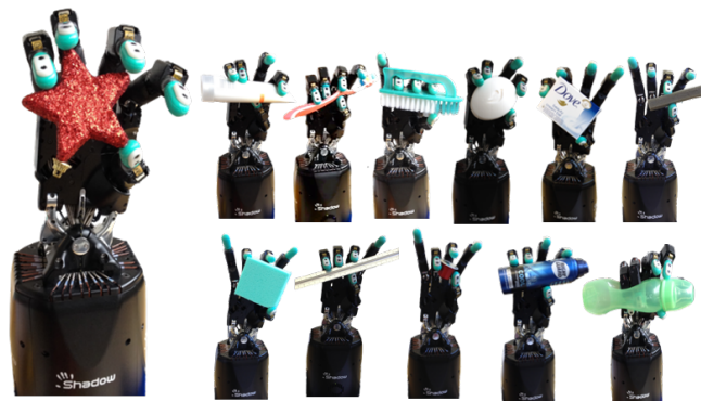
Fig. 2. This figure demonstrates the complex shape in-hand objects considered as New Objects. Employing the proposed tactile transfer learning the Shadow Hand discriminates new objects from their texture with a very few trials whilst re-using prior knowledge.

intelligent contact sensing finger to classify surface materials with Naive Bayes classifier [7]. Hu et al. used Support Vector Machine (SVM) to classify five different fabrics by sliding a finger-shaped sensor over the surfaces [4]. A robot actively knocks on the surface of the experimental objects with an accelerometer-equipped device to discriminate stone, mulch, moss, and grass from each other with a lookup table and k-nearest neighbors (K-NN) techniques [8]. A multi-modal tactile sensor called BioTac was used to perceive tactile information. In this experiment one BioTac sensor was placed on a customized tool and a vibration-free linear staged was used to slide textures under the tactile sensor. In [9], the Shadow Hand with the BioTac sensor on the index