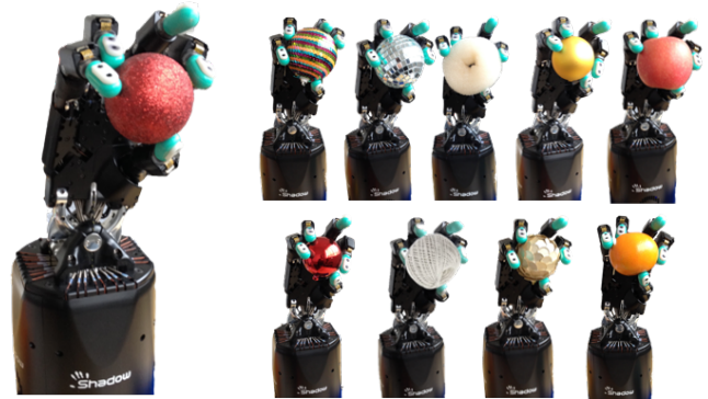
Fig. 1. This figure shows the uniform in-hand objects considered as Prior Objects. The Shadow Hand with the BioTac sensors is exploring the texture properties of the in-hand objects with an identical shape. It moves any of the fingertips to slide over the objects surface and uses the proposed tactile descriptors to extract robust tactile information.