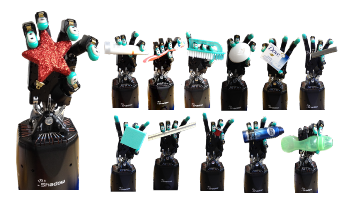
Fig. 2. This figure demenstrates the complex shape in-hand objects considered as New Objects. Employing the proposed tactile transfer learning the Shadow Hand discriminates new objects from their texture with a very few trials whilst re-using prior knowledge.

intelligent contact sensing finger to classify surface materials with Naive Bayes classifier [7]. Hu et al. used Support Vector Machine (SVM) to classify five different fabrics by sliding a finger-shaped sensor over the surfaces [4]. A robot actively knocks on the surface of the experimental objects with an accelerometer-equipped device to discriminate stone, mulch, moss, and grass from each other with a lookup table and k-nearest neighbors (K-NN) techniques [8]. A multimodal tactile sensor called BioTac was used to perceive tactile information. In this experiment one BioTac sensor was placed on a customized tool and a vibration-free linear staged was used to slide textures under the tactile sensor. In [9], the Shadow Hand with the BioTac sensor on the index