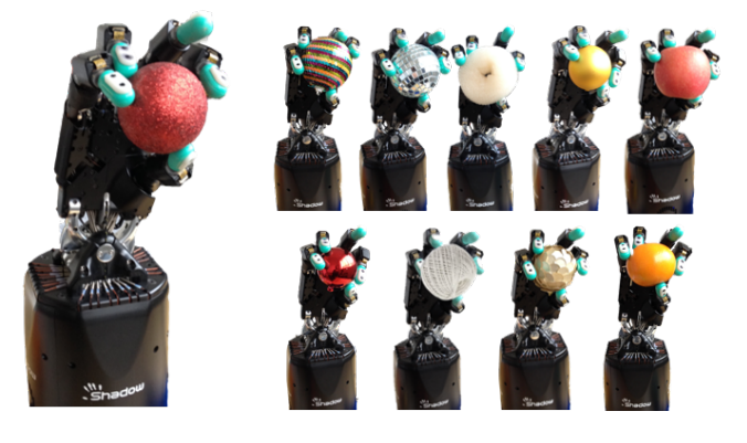
Fig. 1. This figure shows the uniform in-hand objects considered as Prior Objects. The Shadow Hand with the BioTac sensors is exploring the texture properties of the in-hand objects with an identical shape. It moves any of the fingertips to slide over the objects surface and uses the proposed tactile descriptors to extract robust tactile information.