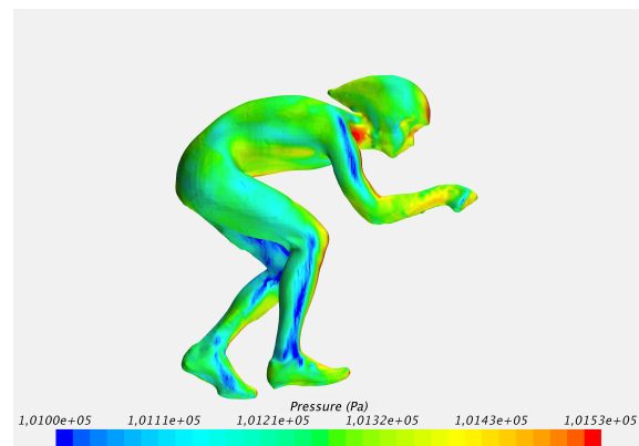
Figure 6: Pressure on the cyclist, computed by CFD simulation.

The CFD simulation (figure 6) focused only on the cyclist, whereas wind tunnel test and field test considered the total AC_d . During both the wind tunnel test and the field test, we subtracted the AC_d of the bicycle measured in the wind tunnel ( 0.053 \text{ m}^2 ) to obtain the AC_d of the rider for each, and to compare them with the CFD AC_d .