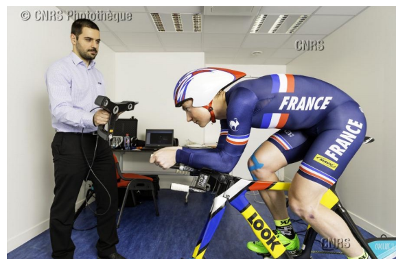
Figure 1: Picture of the 3D scanning setup.

At last, static laser scanner tested (Focus 3D, Faro, Villepinte, France) was unable to reach all the cyclist and bicycle areas in a single operation, because of masking the direct line of sight.