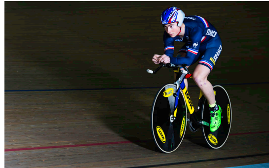
Figure 5: Picture of the cyclist during the field test.

meter and the speed sensor were paired with a Garmin power control (Garmin 810, Olathe, USA). The data were analyzed with the use of the TrainingPeaks software (WKO4, Peakware, Boulder, USA). A beeper was used to manage the pace during the whole exercise.