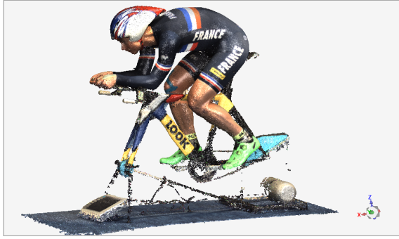
Figure 2: Model obtained with the Faro freestyle 3D.

This system could be used for both CFD modeling on bicycle parts, bicycle and rider profile, but also for mannequin or 3D printing parts. Reflective or composite parts could be treated with some caution for 3D scanning, sometimes by applying talcum powder on surfaces to improve quality of obtained scatter plot.