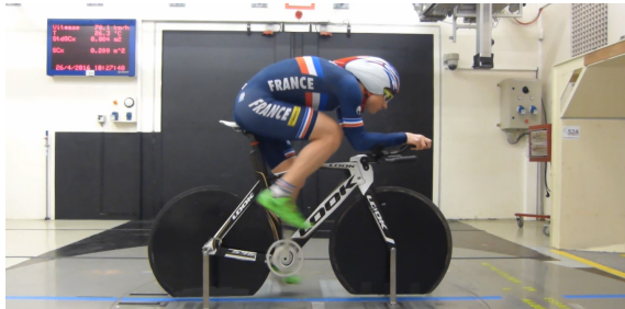
Figure 4: Picture of the cyclist during the wind tunnel test.

wind speed of 50 \text{ km.h}^{-1} . Measurements were recorded over 30s once the wind speed was stabilized (Garcia-Lopez et al., 2008).