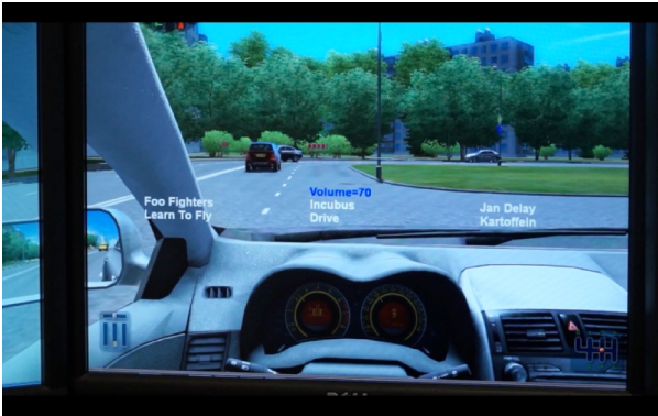
Figure 1. Head-Up Display Interface in a music player item.

In the HUD system, we implemented a menu layout similar to the Cover Wheel Layout (but with no 3D effect) [17], as shown in Figure 1. As shown by Mitsopoulos-Rubens et al. [17], this layout structure should not have an impact on performance compared to a list layout, often used in other HUD interfaces. The items of the list are displayed horizontally, with the selected item in the center, highlighted. The HUD was implemented only for the