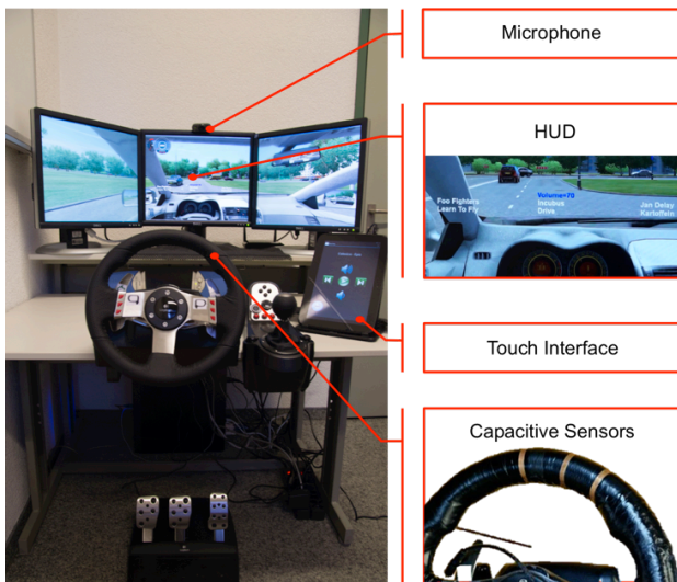
Figure 4. Experimental setup

For measures of user performance and subjective user ratings, a one-factorial analysis of variance (ANOVA) was carried out, followed by explorative post-hoc comparisons, for which a Bonferroni correction was applied. For most variables, distribution of the data meets normality assumption (e.g., DALI, driving time, measures of affect, SUS usability), there are however several measures that do not (i.e., SUS learnability, no. of accidents). Since our sample is not too small, the sample size is equal in each experimental group (N = 20) and kurtosis is most often rather small, we applied an ANOVA because this method tends to be robust if sample sizes are equal in the different experimental conditions. For the analysis of the data on participants' affective states, a one-factorial analysis of covariance (ANCOVA) was carried out, with the initial baseline measure (taken prior to task completion) used as covariate.