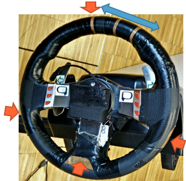
Figure 2. Logitech G27 Steering Wheel equipped with capacitive sensors, also called WheelSense. Red arrows depict hand-taps and blue arrow the hand-swipe.