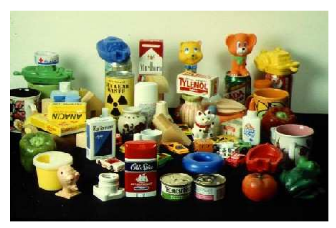
Fig. 2 Sample objects of COIL-100 database