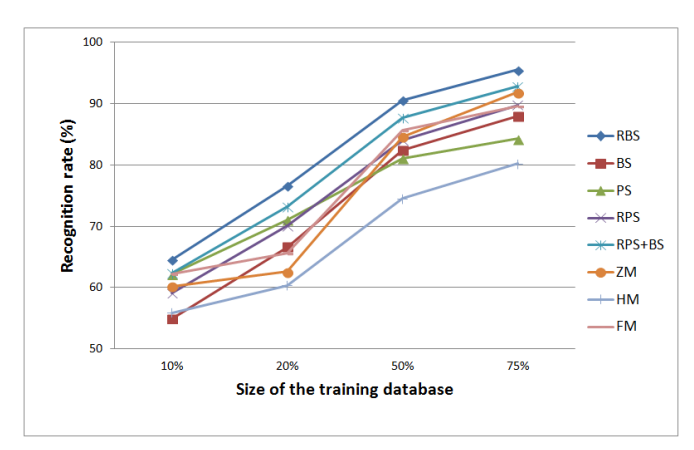
Fig. 3 Classification rate for different size of the training database. The test results for ZM, HM, FM, and SIFT are taken from [7].

the combination of the RPS and the BS give better results than the other global invariant descriptors.