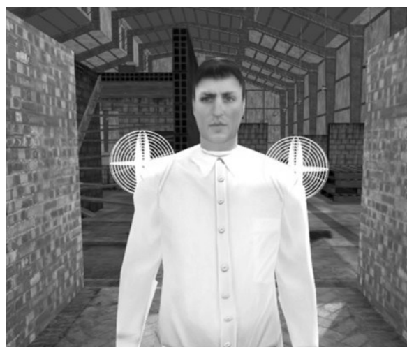
Figure 3: The recording of all-body movements are used to build a co-localized avatar. The spheres' centers represent the vibrating actuators position on the subject's shoulder. Their size represents the spatial domain in which the actuators were active (that is when the subject shoulder's distance to a virtual object was inferior to their radius).

We studied two aspects. The first one is the type of feedback. It could be only visual or augmented with vibrotactile stimulation. The vibrotactile feedback operates as a radar (similar to those in cars). When the subject approaches his shoulder from a virtual object (a side of the door in this case) a discontinuous vibration is sent to the corresponding actuator (with an intensity inversely proportional to the distance). The second condition is the presence (or not) of a virtual body also called "Avatar" (co-localized with the subject's body).