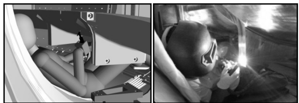
Figure 1: Welding task simulation in Virtual Reality and with a real mockup.

maneuver in a confined environment, to pay attention to his/her whole body and adopt a correct posture with respect to the environment (see Figure 1). Studies like the feasibility of assembly and maintenance tasks in complex and very confined environments require enhanced features such as dynamic and biomechanically realistic virtual humans (also called avatars) and need a substitute for the missing haptic feedback.