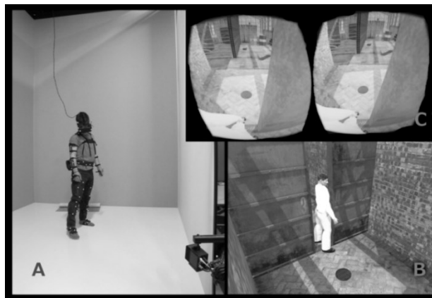
Figure 2: A. One subject in the physical environment. He wears the HMD and is equipped with body markers. B. A representation of the subject passing through the aperture. C. Subjective view inside the HMD.

Subjects were equipped with an HMD Oculus Rift DK2 device and a vibrotactile device that we developed previously [7]. Two vibrators were placed on the shoulders side. The subject's all-body position was obtained by an optical tracking system (ArtTrack®) (Figure 2, A) in order to record the subject's movements. These positional data could be connected to a real-time and co-localized virtual representation of the subject's body (Figure 2, B).