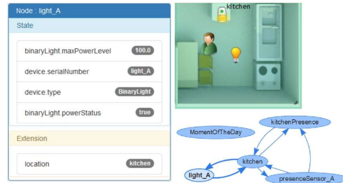
Fig. 3. Light Follow Me application – zoom on the kitchen.

Our framework gives an understandable representation of the global context. The bottom right corner of Fig. 2 presents the graph of the model displayed on the iCasa simulator: devices are gathered by location, each room is enhanced with a physical parameter aggregating and synthesizing presence status, and an independent entity provides the moment of the day. In addition of the graph view, the simulator can display state properties and state extensions of an entity. This functionality is shown on Fig. 3 with light_A.