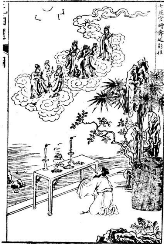
Figure 0.4: Following Peach Blossom advice, Peng Jian 彭翦 prays for longevity to the Seven Stars of the Northern Dipper (Woodblock illustration for the Yuan 元 Zaju 雜劇 dramatic version of the Peach Blossom story, Yuan qu xuan 元曲選, edition of Zang Maoxun 臧懋循, 1615).