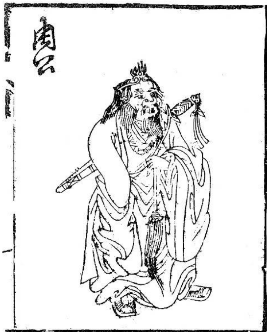
Figure 0.3: Portrait of Zhougong, idem