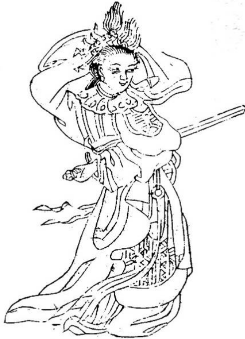
Figure 0.2: Portrait of Taohuanü, in the 1848 Edition