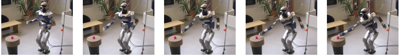
Simultaneous right-hand and left-hand reaching: the target imposed to the left hand is the final position reached in the previous (right-hand only) movement.