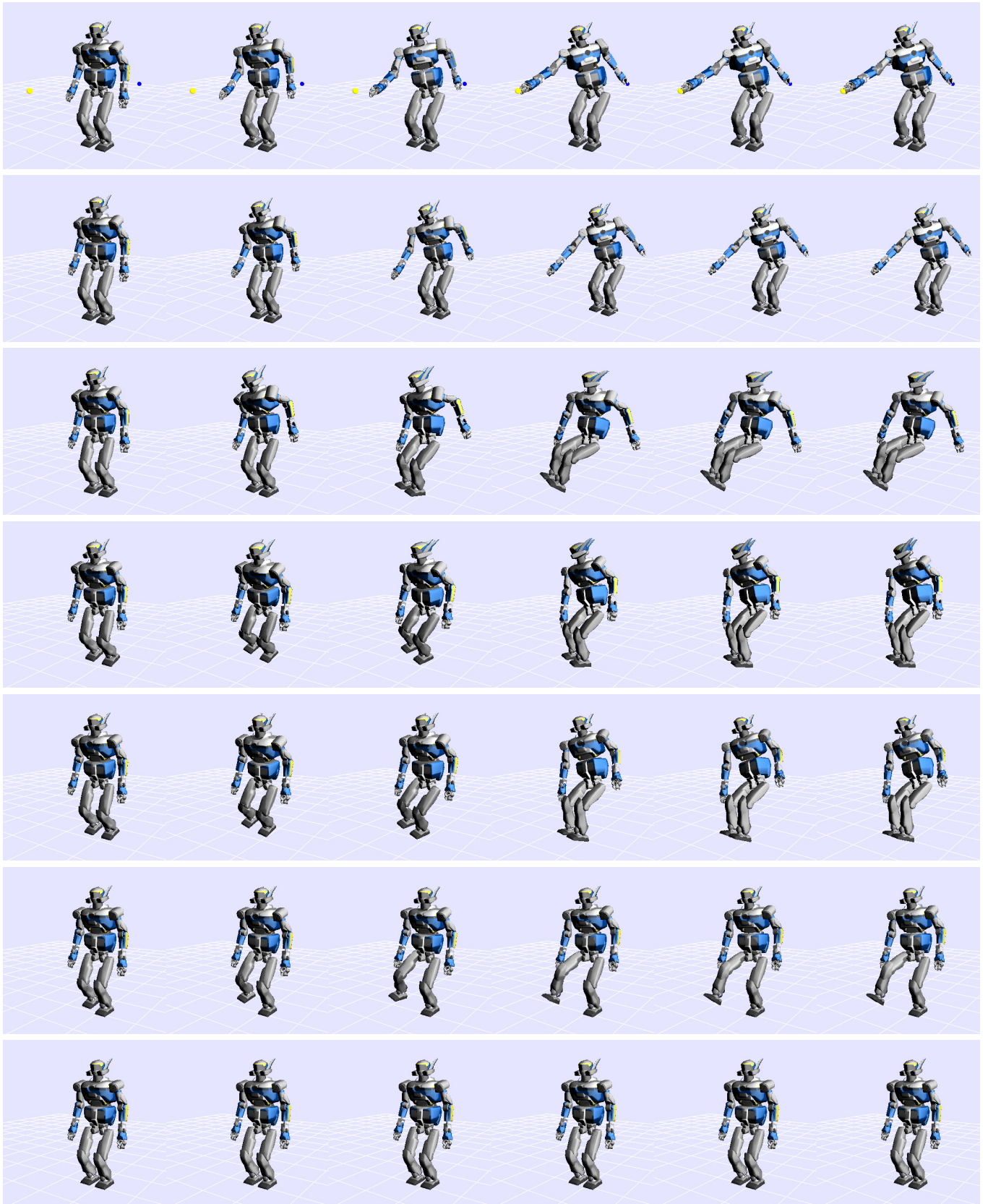
Figure 3: The original movement refers to Figure 7 (bottom): successive projection of the motion after detecting each of the seven tasks. From top to bottom: original movement; removing the right-hand task; removing the center-of-mass task; removing the gaze task; removing the left-hand task; removing the left-foot task; removing the right-foot task. On the last row, all the tasks are canceled, the projected movement is totally nullified.