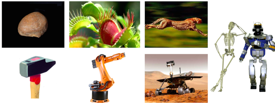
Figure 1 Stones and hammers do not move by themselves. Movement is a prerogative of living (and robot) system. Plants (and manipulator robots) moves to bring the world to them via self-centered movements. Animals (and mobile robots) navigate to explore the world. Human (and humanoid) actions are built from both type of movements.