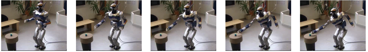
Right-hand reaching while enforcing the balance: the left hand had moved only to correct the balance.