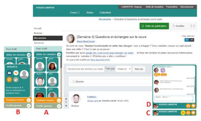
Figure 2. Recommendations and chat widgets

time. The second tab gives access to a list of previous chats, and one can reopen them to keep interacting with the student(s) associated to that chat (D).