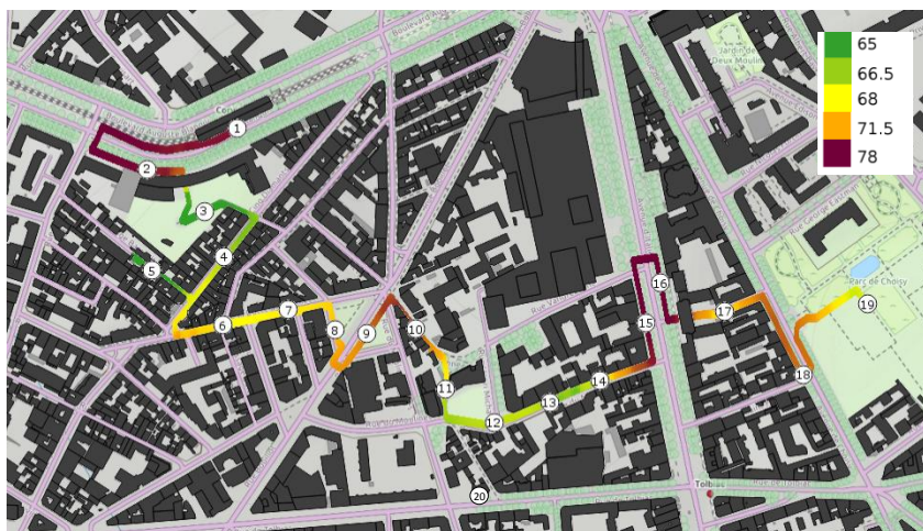
Figure 1: Noise Map of the studied path, interpolated from mobile measurements (LAeq - dB).

The in situ experiment consists of a perceptive test performed 4 times (referred further in the text as “runs” over a 2,1 km-long path, located in Paris (13rd district) as described in Figure 1. Perceptive data were collected during 3-to-5 minute stops over 19 points located along the path, resulting in a test duration of approximately 45 minutes. The points were chosen to contain a large variety of urban sound environments on both sides of soundscape transitions, resulting in an average distance of 115 meters between points.