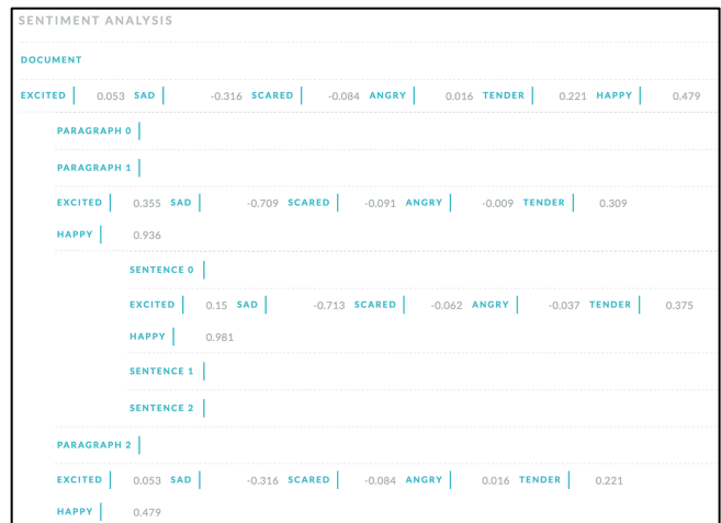
Figure 6. Sentiment analysis results computed for the sample input data.

results express absolute values for negative emotions, therefore emphasizing the positive nature of the entire text.