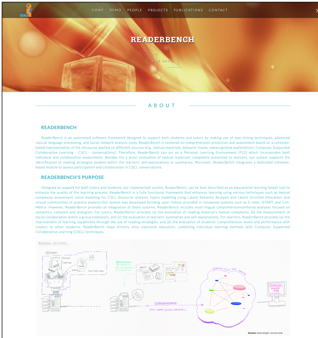
Figure 1. ReaderBench main web interface.

As an overview, the ReaderBench framework makes use of the Standard Core NLP [10] for implementing natural language processing pipelines consisting of the following processes [1]: tokenization, sentence splitting, part of speech tagging, lemmatization, named entities recognition, dependency parsing, and co-reference resolution. Whereas for English the full pipeline is supported, for other languages (e.g., French, Spanish, Italian, Romanian and Dutch) only the core steps are being performed. In addition, ReaderBench includes multiple libraries such as Apache Mahout ( http://mahout.apache.org/ ), Gephi ( http://gephi.org/ ), and Mallet ( http://mallet.cs.umass.edu/ ).