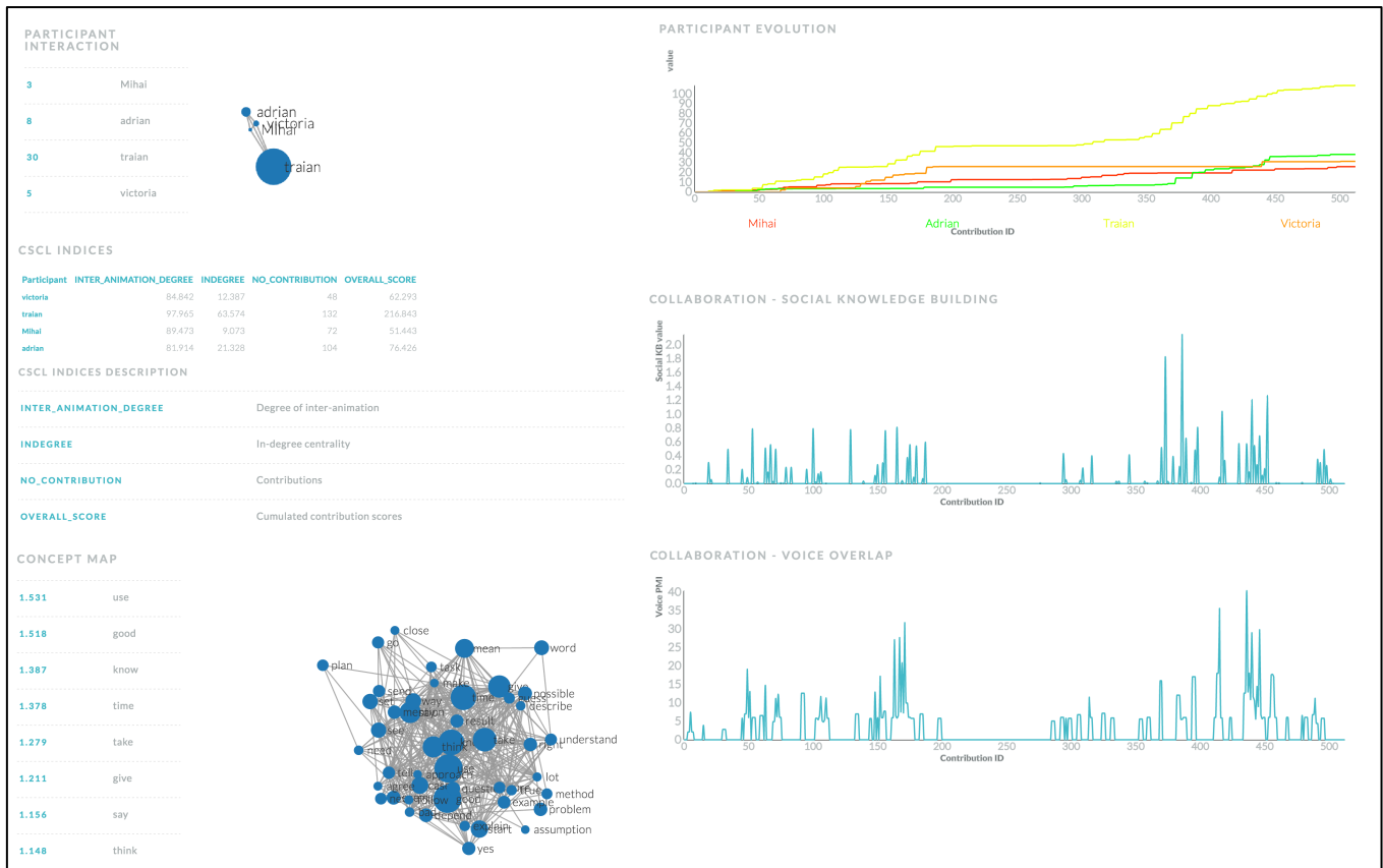
Figure 5. CSCL graphs generated for a sample conversation file.