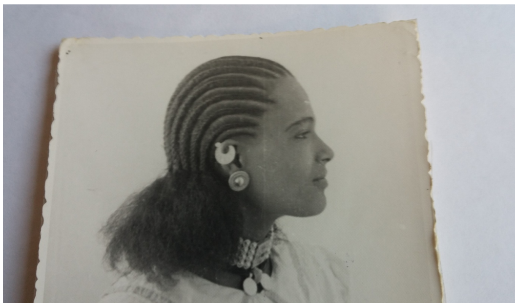
Figure 1. A Madama from Eritrea. Madamism was a formal cohabitation between an Italian man and an Ethiopian woman.

When we were in Ethiopia to accomplish a Ph.D. research we concluded (maybe too rapidly) that only men could meet the process of progressive insabbiamento . The reality might be more pragmatic. If Italian men stayed in Ethiopia more importantly than the Italian women it is less related to gender roles but more probably a consequence of population density and balance. The young colons came as singles and found local partners because it was due to the demographic context. Amedeo Venditti expresses it lucidly when he says: that he was with an Ethiopian lady because it was the only opportunity he had to share a life with a woman. He summarizes the high number of mixed couples by a narrow “market of marital opportunities”: