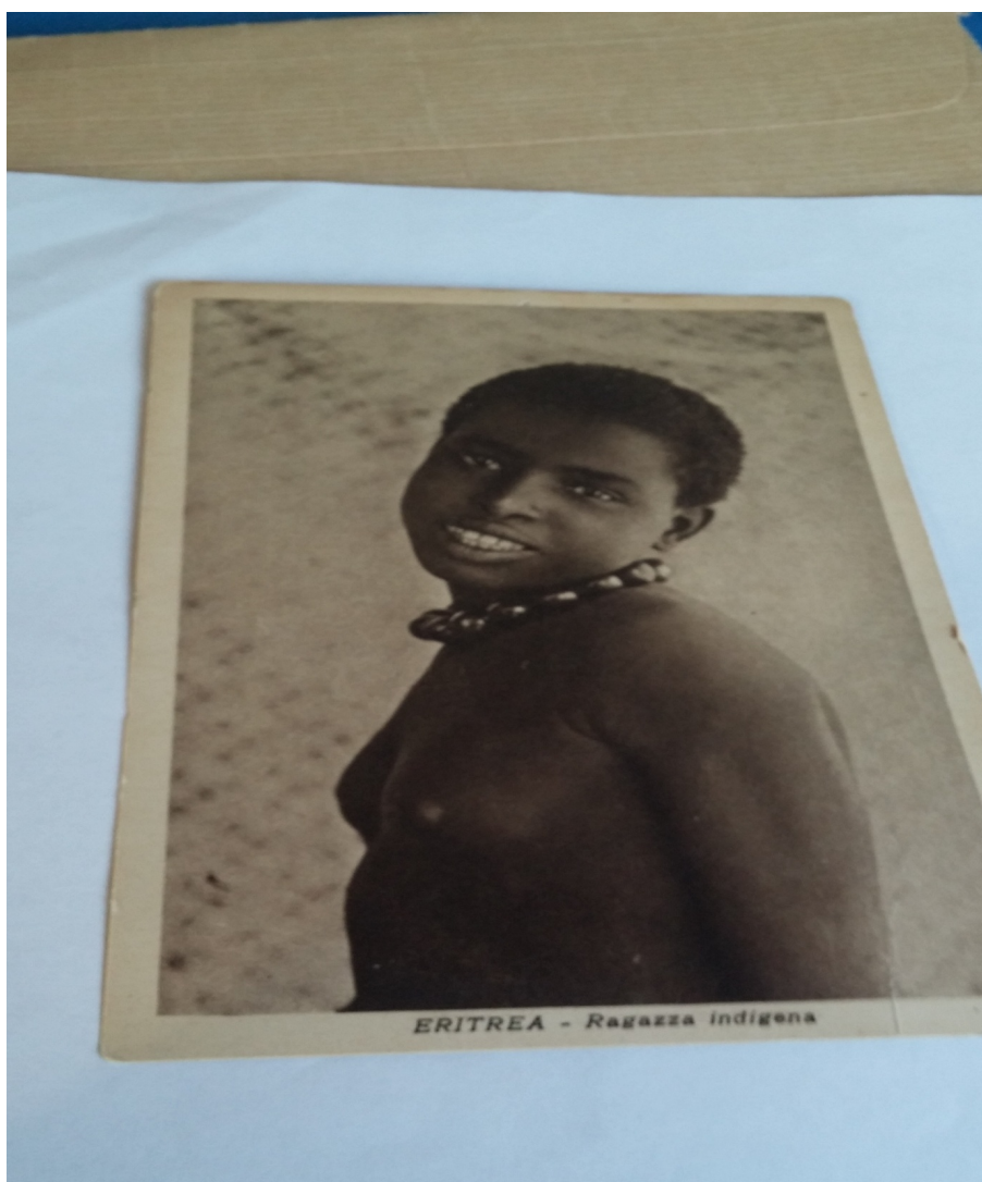
Figure 3. Italian postcard showing a underaged girl in Eritrea. They were called “bambine” and these postcards sold in the shops during colonial time illustrate the theory of “bambine mania”.