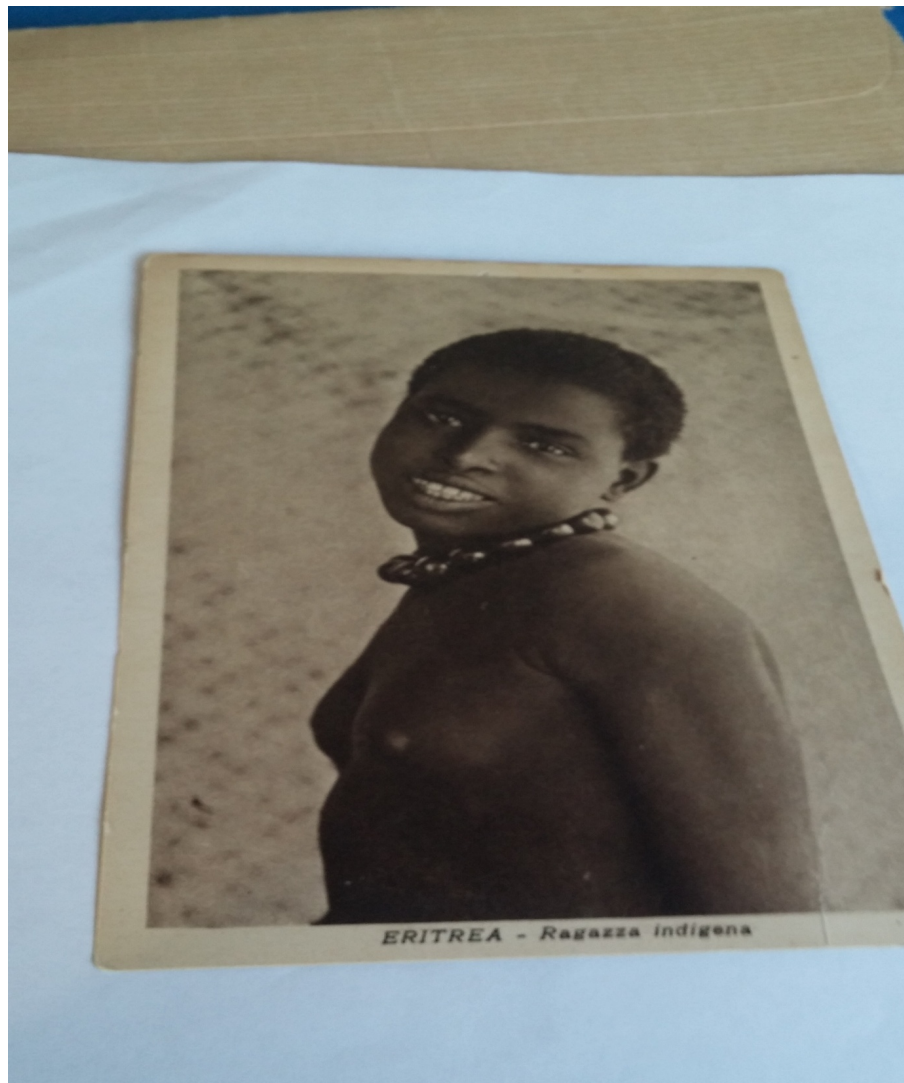
Figure 3. Italian postcard showing a underaged girl in Eritrea. They were called “bambine” and these postcards sold in the shops during colonial time illustrate the theory of “bambine mania”.