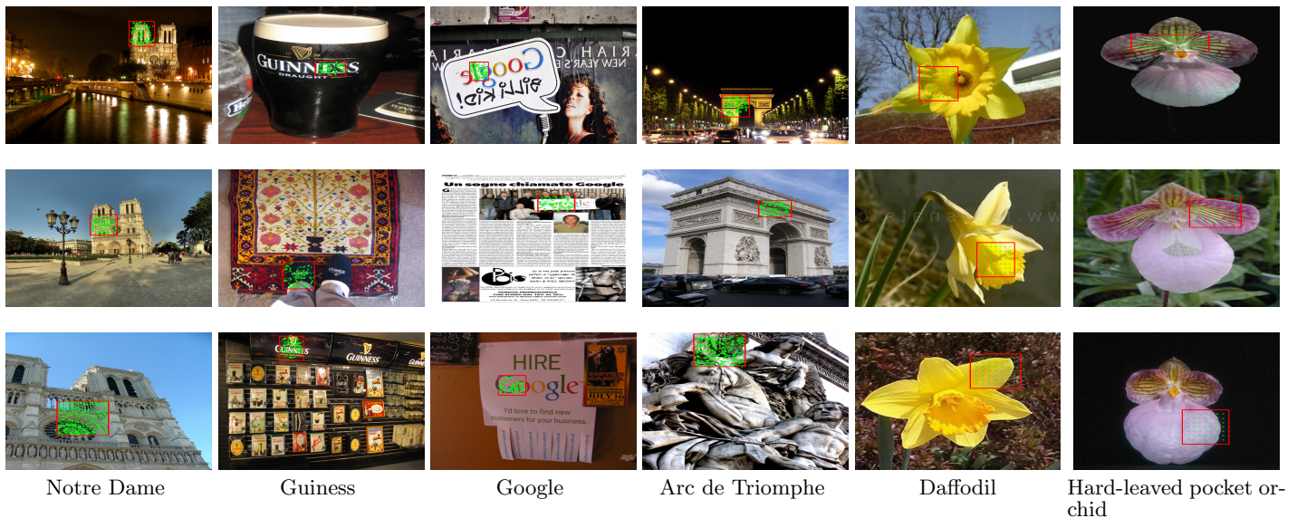
Figure 1: Learned Spatial Atoms for 6 classes