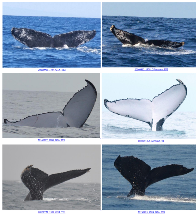
Fig. 2. Three false positives (each line corresponds to 2 distinct individual whales)

the caudal fin that is the most discriminant pattern for distinguishing an individual whale from another. Figure 1 displays six of such cropped images, each line corresponding to two images of the same individual. As one can see, the individual whales can be distinguished thanks to their natural markings and/or the scars that appear along the years. Automatically finding such matches in the whole dataset and rejecting the false alarms is difficult for three main reasons. The first reason is that the number of individuals in the dataset is high, around 1,200, so that the proportion of true matches is actually very low (around 0.05% of the total number of potential matches). The second difficulty is that distinct individuals can be very similar at a first glance as illustrated by the false positive examples displayed in Figure 2. To discriminate the true matches from such false positives, it is required to detect very small and fine-grained visual variations such as in a spot-the-difference game. The third difficulty is that all images have a similar water background of which the texture generates quantities of local mismatches.