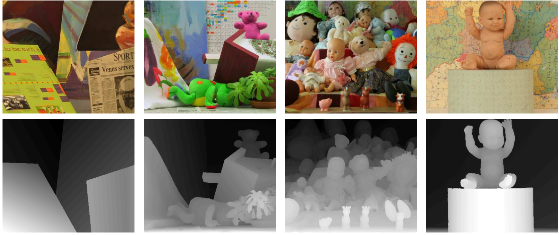
Fig. 1. Left images (Top) of the considered stereo pairs and corresponding ground truth images (Down). From left to right: Venus, Teddy, Dolls, Baby.

MAE and Err errors. As we can see, the precision of the matching has generally been improved when using the color information, except for the Venus stereo pair where color seems to slightly worsen the results. For the other stereo pairs, the mean absolute error was significantly reduced when using the LUV, RGB and I_1I_2I_3 color spaces. However, no significant changes in the results have been noticed when using the LAB color space instead of the grey value information. Table II also includes, for comparison purposes, the results from the global optimization algorithm (GC) of Kolmogorov and Zabih [9] based on graph-cuts. The same observation about the obvious utility of color information in solving the stereo matching problem could be made when comparing the results of the grey value based matching of this method and the color based matching. We can also notice from Table II that the proposed method, compared to the (CG) algorithm, leads always to the best results.