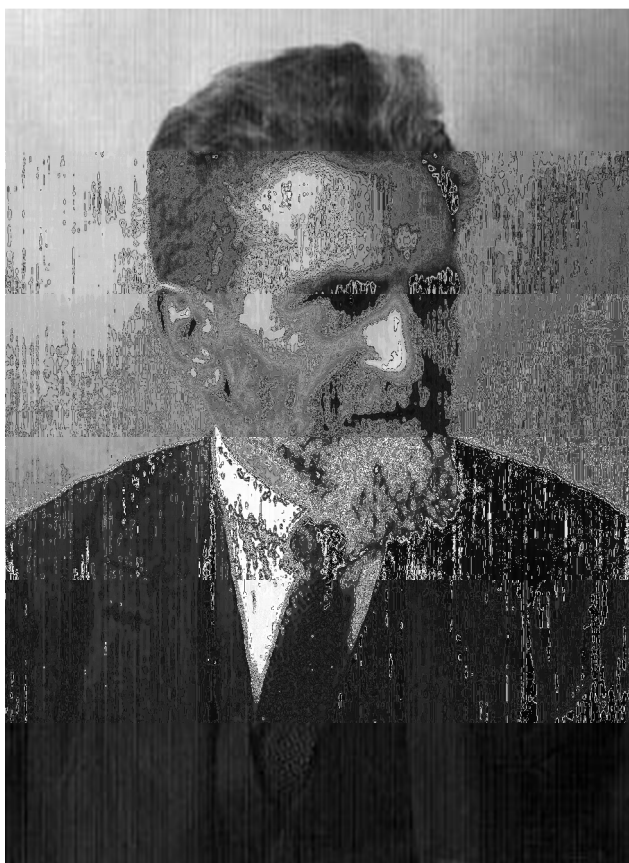
Fig. 1 – Errico Malatesta (1853-1932)