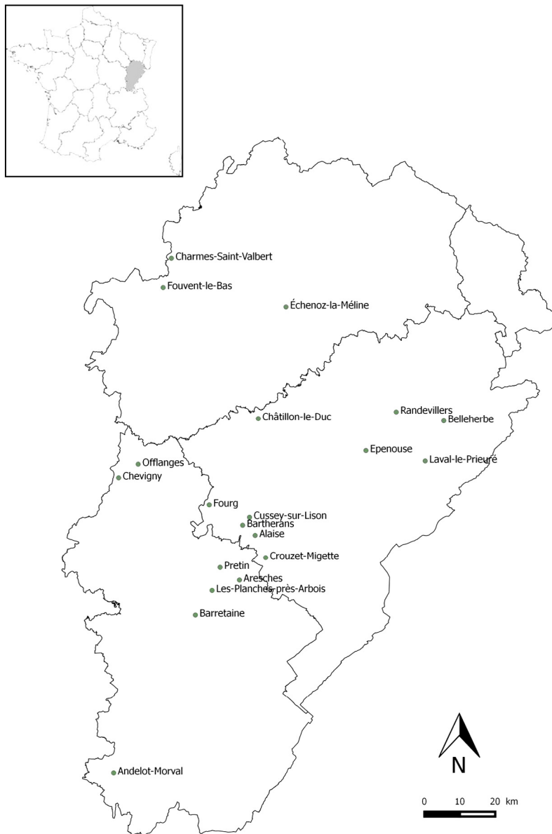
Fig. 1. Location of the 20 lesser horseshoe bat maternity roosts sampled in the Franche-Comté region.

In both sampling sessions, sampling was made when individuals were abundant within the roost and before the birth of offspring. Nine of the roosts sampled in 2010 were re-sampled in 2011. Hence, a total of 20 different maternity roosts were sampled. Plastic sheets were placed on the ground beneath the main clusters of bats and were left for 15 days. In each roost, droppings were randomly collected directly from the plastic sheets for parasitological analyses, placed individually in 2 mL microtubes containing 90° alcohol, and stored at room temperature. Using this methodology, 40 droppings were collected per roost in June 2010, and 24 droppings were collected per roost in June–July 2011. For pollutant analysis, a single pool of droppings (1.0–2.5 g, representing approximately 20–50 droppings) per colony was also collected from the plastic covers and stored at -20\text{ }^{\circ}\text{C} until analysis.