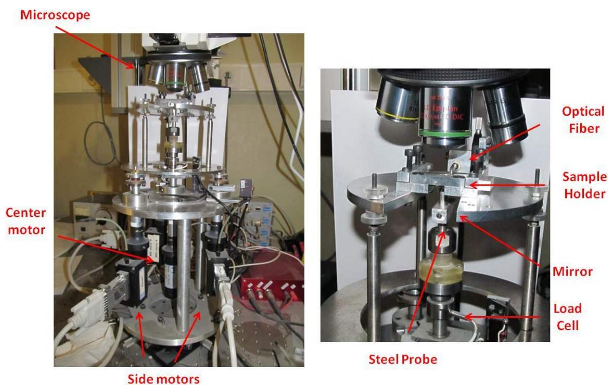
Figure S1: pictures of the overall set-up (left) and the contact zone (right). The steel flat-ended probe (diameter \Phi=5.95 \pm 0,02\text{mm} ) is driven by a central stepping motor while three side motors drive an upper plate. The glass slide on which is deposited the thin adhesive layer, is fixed facing down on this upper plate. The load cell ( 40\text{N} \pm 0,1\text{N} ) required for the measurement of the normal force F_T is positioned in series with the probe.