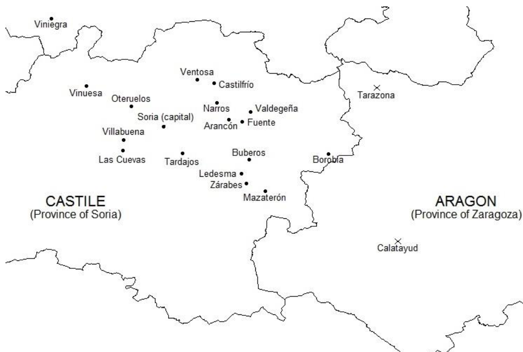
Figure 3: Borrowers' hometown in Soria, 1735.

Notes: Cities with a cross are given for information only. Viniëgra was part of the province of Soria at the time.