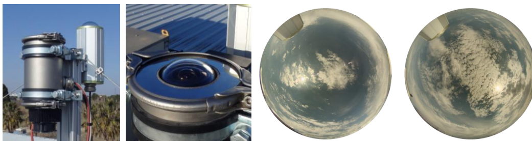
Fig. 1: Overview of the PROMES-CNRS sky imager and two examples of HDR snapshots.

The sky imager consists in a 4-megapixel color camera equipped with a fisheye lens and protected by a waterproof enclosure (Fig. 1). Color images are collected every 20 seconds at a resolution of 1580 x 1580 pixels, with 10 bits per channel. This is a second-generation prototype that is designed to outperform the first one installed at PROMES-CNRS since mid-2013. Among the different improvements, we find: a stronger neutral density filter (ND 2.0), a faster acquisition frame rate ( \approx 30 fps), a higher bit depth, a camera temperature controller and, more generally, a full access to camera settings. The system is not equipped with a solar occulting device which is frequently used to reduce the light intensity reaching the sensor [1]. Indeed, although this device improves the sky visibility by reducing pixel saturation, it occults the circumsolar area, which provides vital information about the very short-term solar irradiance fluctuations. This issue is avoided by the sky imager because it is able to generate high dynamic range (HDR) images in order to fully capture the range of irradiance produced by sun and clouds.