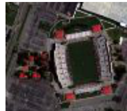
Fig. 2. Real data set: the third data we evaluate the proposed models with is a 105-by-128-by-144 hyperspectral cube taken of the since demolished Robertson stadium at the University of Houston. Shown is the approximate color image using three bands near red, green, and blue.

on real data to generate a hyperspectral image with synthetic variability. For both synthetic data sets there are approximately three materials in each image pixel, and the data cube has been reduced by a factor of two due to large performance costs in optimizing \lambda for the experiments. The third data set, shown in figure 3, is an aerial image taken of a stadium with surrounding parking lots, a parking structure, and trees among other features. For these data sets we use k = 5 and learn m endmembers from k randomly selected subsets of 80% of the data. For each subset VCA is run for 100 iterations.