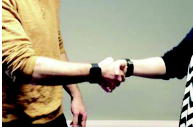
Figure 2 Two people shaking hands using smartwatches.