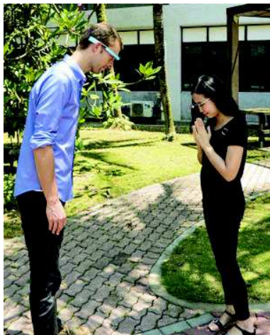
Figure 4. Two users wearing a head-worn display bow and pair devices.

This paper is inspired by the CHI 2015 Workshop on Mobile Collocated Interactions. We thank Dan Ashbrook, Jo Vermeulen and the others for their input.