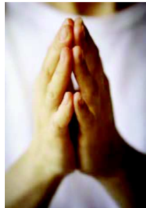
Figure 1. Two examples of greetings: western handshaking and thai greeting.

form an elaborate device ecology that allows users to appropriate and choose devices based on their affordances, properties and functionality. Users are no longer interacting with single devices, but rather use a multitude of devices as portals into a shared information space. Within the research community the complexities, interactions and usefulness of traditional devices, such as phones and tablets, are relatively well understood [4, 10, 14]. These novel wearable devices, however, pose a set of new fundamental social challenges from the user perspective related to (i) device configuration and pairing, (ii) information exchange, and (iii) collaborative work in collocated situations.