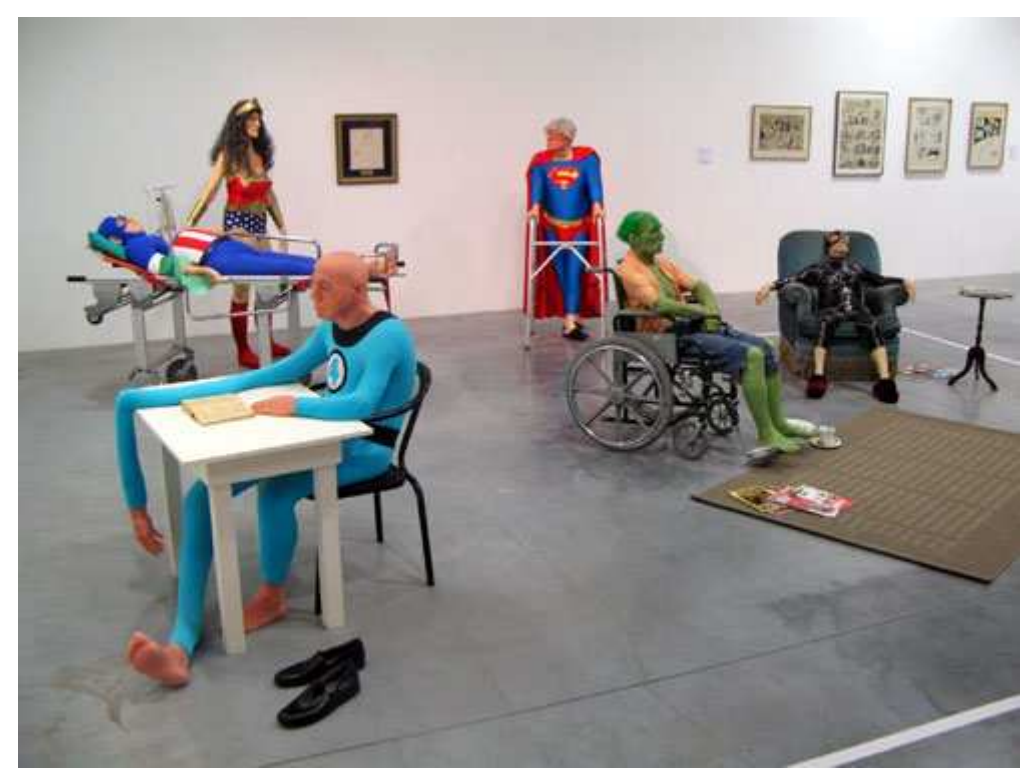
Fig. 2 Art installation (G. Barbier) and original comic art - Vraoum! (2009)