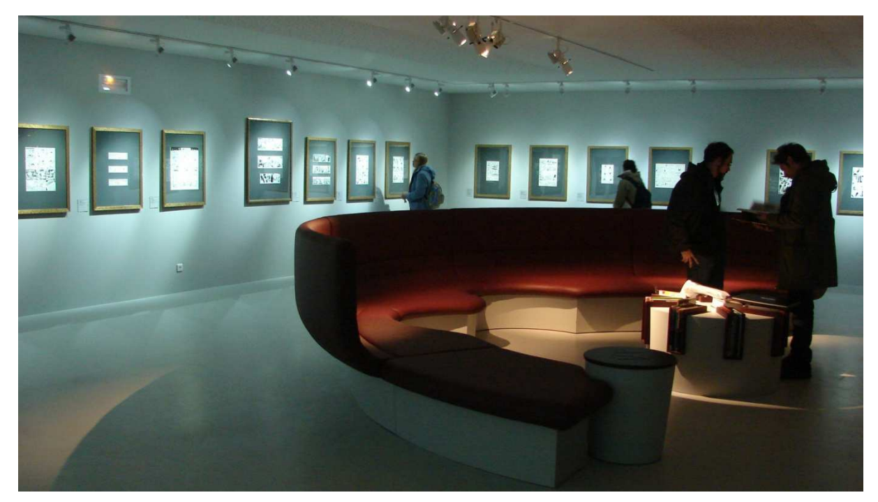
Fig. 7 Framed art and reading lounge - Musée de la Bande dessinée (Le Salon) (2009)