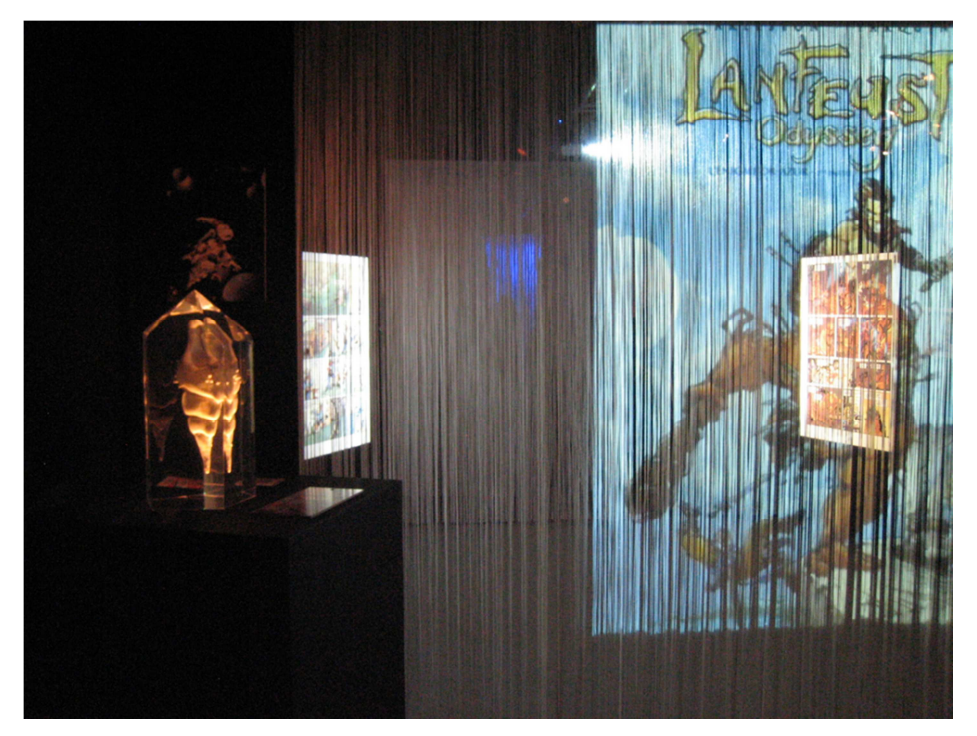
Fig. 4 Artifacts, immersive scenography and art reproduction - Le Monde de Troy (2011)