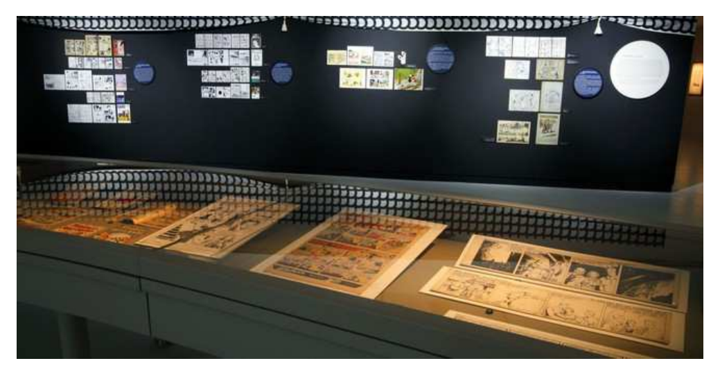
Fig. 6 The permanent collection - Musée de la Bande dessinée (2009)