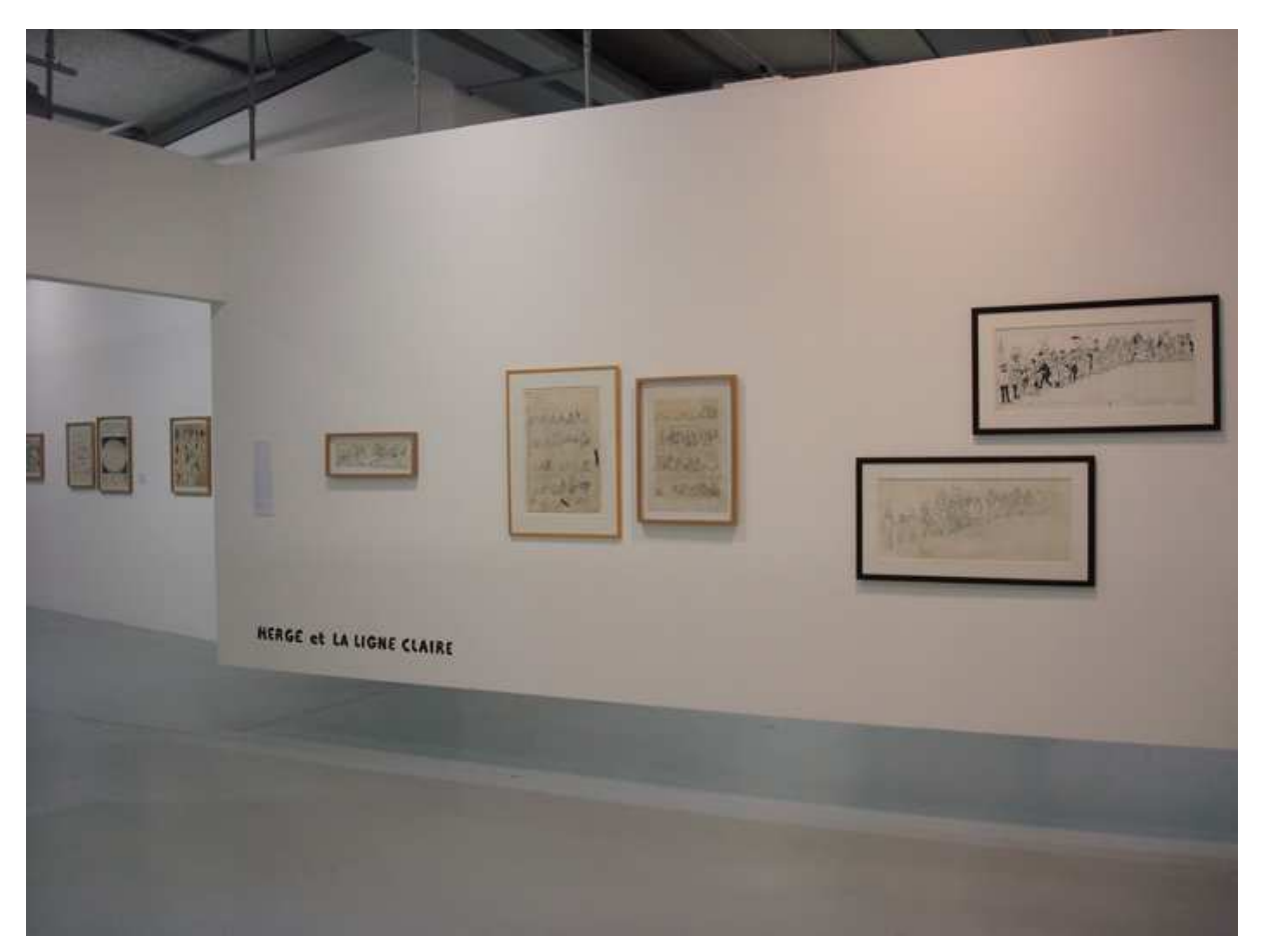
Fig. 1 A traditionnal presentation - Vraoum! (2009)