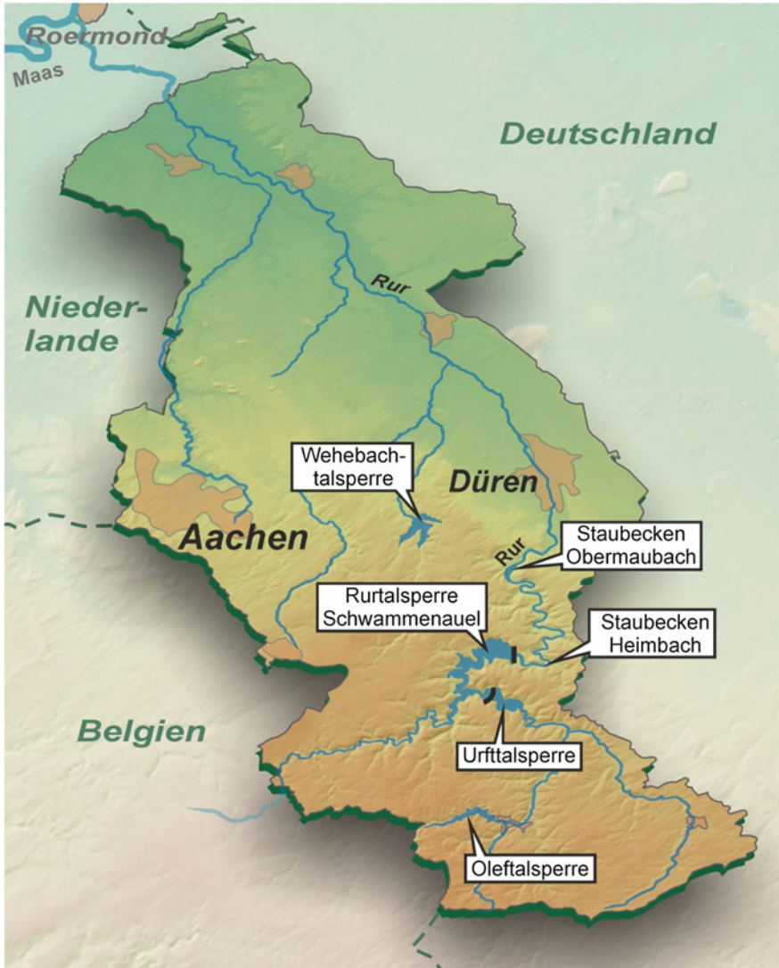
Fig. 4.1 WVER region in the catchment of the Rur River, including the the main reservoirs in the Eifel region