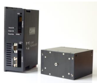
Fig.2 CSA96 and MICA200M prototypes

Main characteristic of MICA200M (See Fig. 2) are presented including dimensions, forces, stroke, bandwidth and main adapted applications.