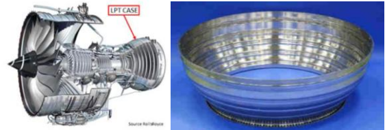
Fig.1 Turbine casing work-piece

The INTEFIX project aims at improving the machining of thin work-pieces thanks to the use of intelligent fixture which includes the reduction of vibration, the compensation of constraints relaxation and the accurate positioning of work-pieces. The study case described here is the reduction of chatter vibration during the turning of a turbine casing work-piece shown in Fig. 1[1]. The reduction of vibration is performed with the help of active systems embedded on the work-piece support which rotates during the turning. The actuation needs to be compact, generate high forces and includes electrical power supply with anti vibration control.