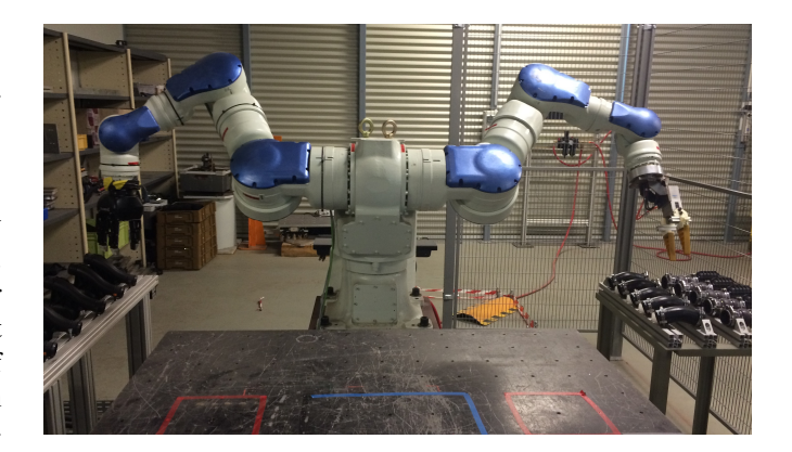
Fig. 2. Use-case to study a human robot collaboration

We want to know how a human-robot interaction can be accepted by an operator. Many parameters have to be evaluated; virtual reality can be an interesting tool to perform tests on new human-robot interaction configurations. We