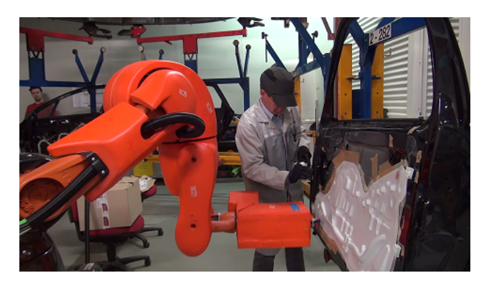
Fig. 1. Use-case to study a human robot copresence

For this use case, the operator and the robot work side by side, sharing the same area, but working on different tasks. This use case is inspired from concrete operations on car doors. The robot role on the door is to fix a sealing sheet on the door. To do this, it applies a caster on the edge of the sheet to stick it definitively. In car plants, this operation is currently done by a human but it can lead to muskuloskeletal disorders, especially on the wrist of the operator. That is why a robot was chosen to perform this task while operators are concentrated on other operations next to the robot, see Fig. 1.