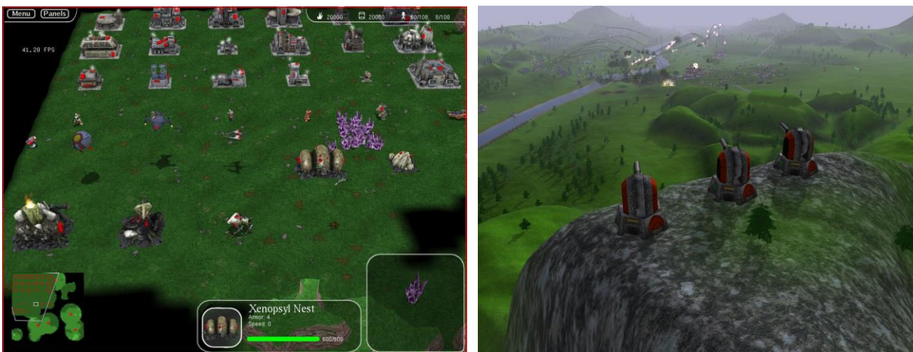
Figure 1. On the left: ORTS. On the right: Spring