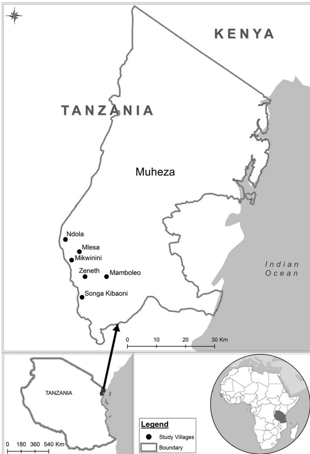
Fig. 1. Map of the area where collections of malaria mosquitoes were performed.