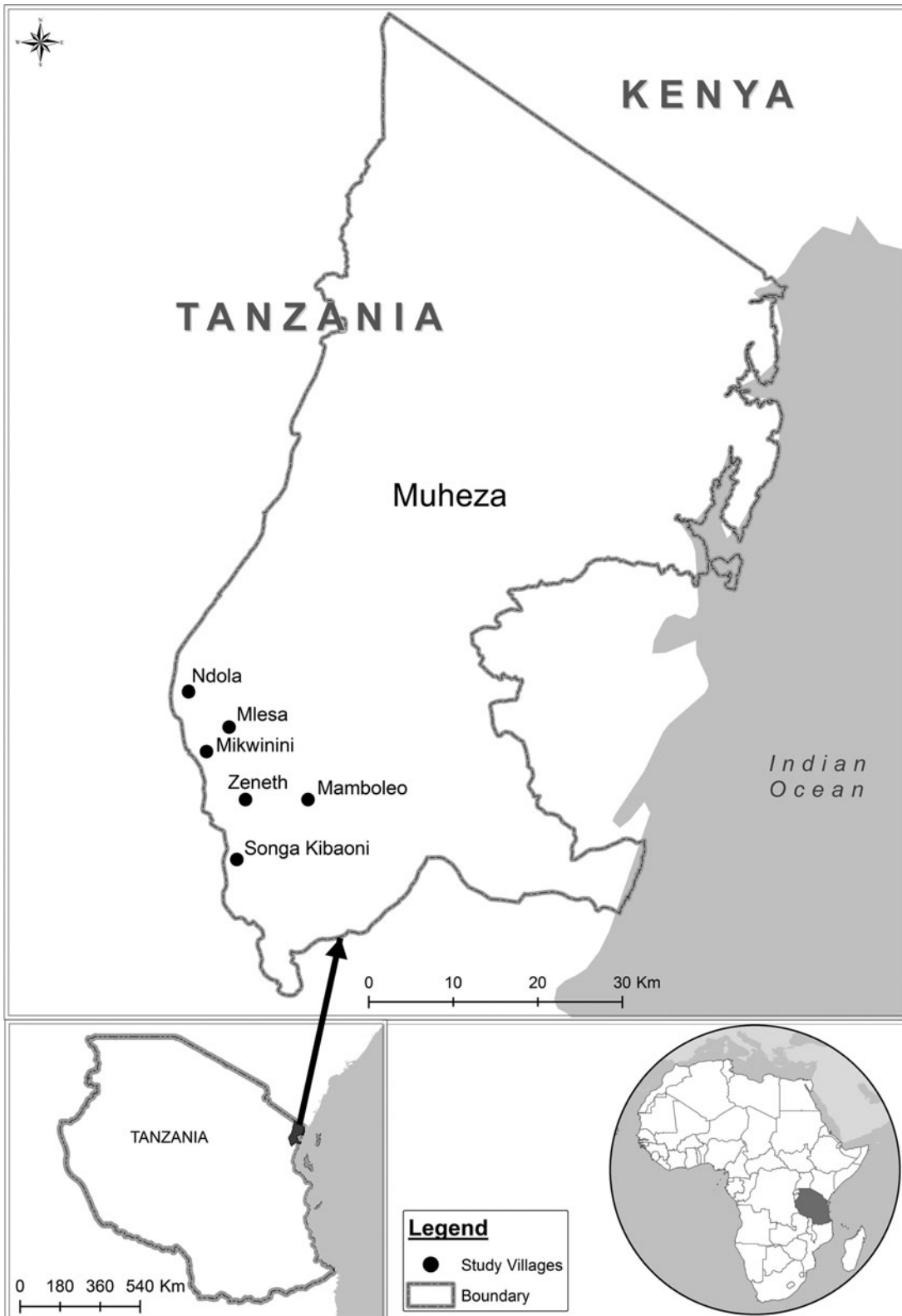
Fig. 1. Map of the area where collections of malaria mosquitoes were performed.