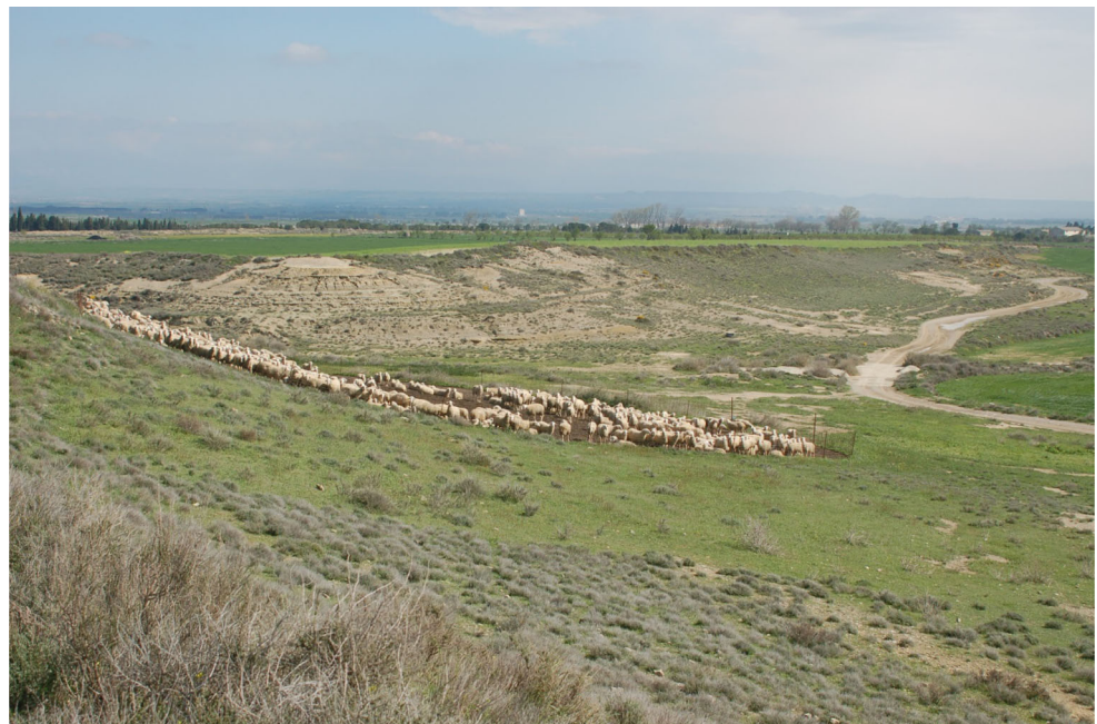
Fig. 2 Livestock use of stubble and straw from winter cereals and forage grazed from fallows is a common feature of large dryland regions such as the Mediterranean basin. The activity contributes to maintain a mosaic of cultivated and natural areas enhancing ecosystem services. If properly managed, livestock integration in dryland areas contributes to the increase in soil organic carbon contents

The use of conservation tillage and more recently no-tillage practices leave the soil covered by crop residues, which has