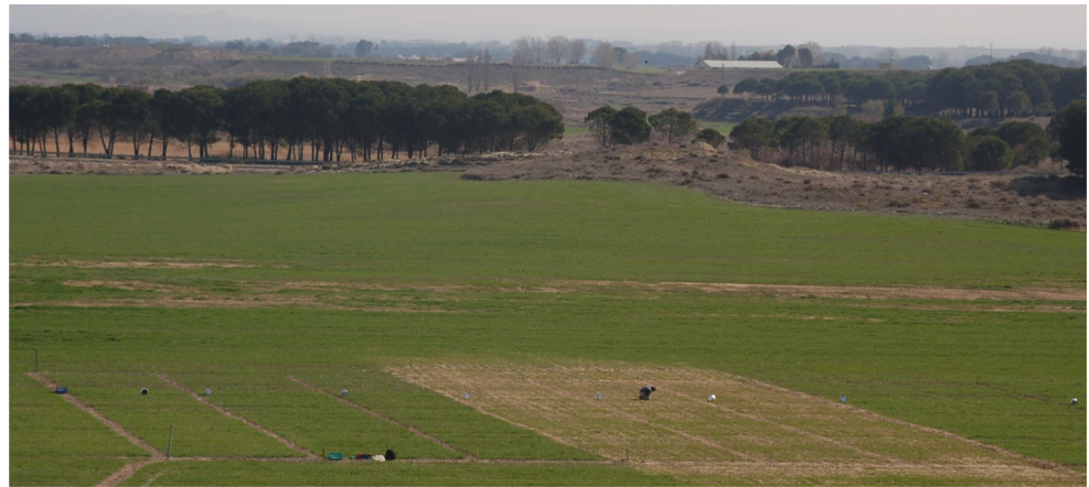
Fig. 1 A semiarid dryland agricultural system in the Ebro valley (NE Spain): a tillage and fertilization experiment was established in 2010 in a commercial 4-year no-tilled field devoted to winter cereal production. The impact of a single pass of disk plow (15-cm depth) before sowing ( plots of the right ) and of the maintenance of no-tillage ( plots of the left ) on crop performance is shown

process: (i) at eroding sites, SOC is decreased because plant inputs are decreasing with decreased productivity; (ii) SOC decomposition is enhanced due to physical and chemical breakdown during detachment and transport; and (iii) decomposition of the allochthonous and autochthonous C fraction buried is reduced (Van Oost et al. 2007).