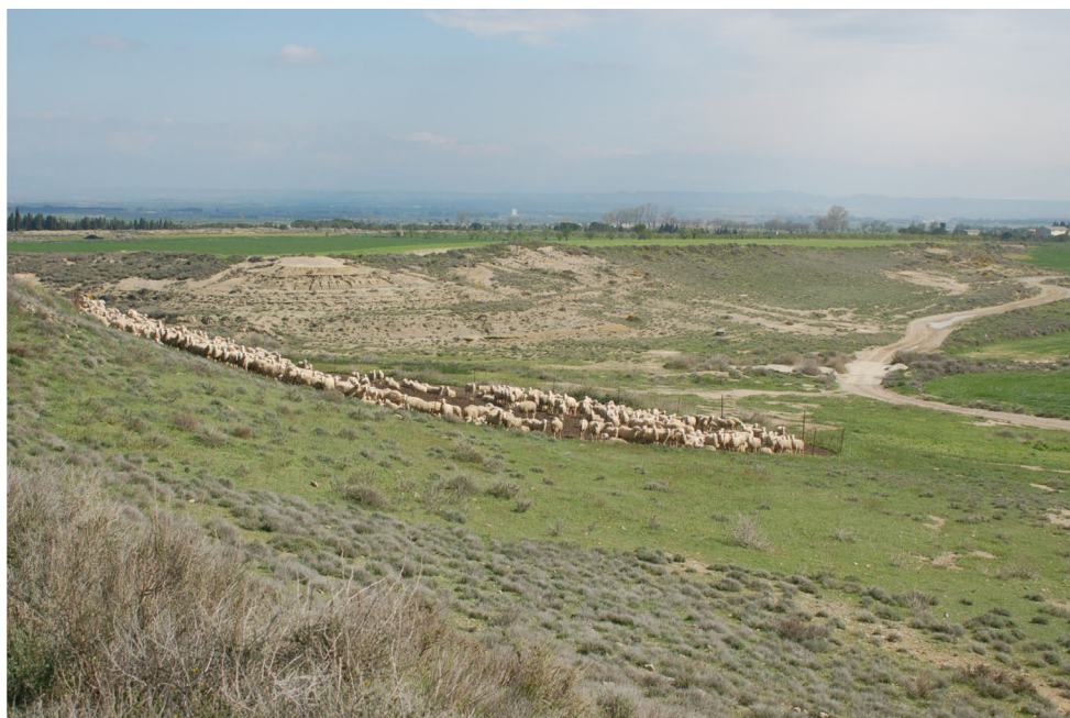
Fig. 2 Livestock use of stubble and straw from winter cereals and forage grazed from fallows is a common feature of large dryland regions such as the Mediterranean basin. The activity contributes to maintain a mosaic of cultivated and natural areas enhancing ecosystem services. If properly managed, livestock integration in dryland areas contributes to the increase in soil organic carbon contents

The use of conservation tillage and more recently no-tillage practices leave the soil covered by crop residues, which has