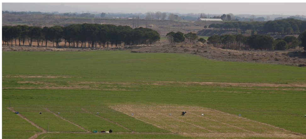
Fig. 1 A semiarid dryland agricultural system in the Ebro valley (NE Spain): a tillage and fertilization experiment was established in 2010 in a commercial 4-year no-tilled field devoted to winter cereal production. The impact of a single pass of disk plow (15-cm depth) before sowing ( plots of the right ) and of the maintenance of no-tillage ( plots of the left ) on crop performance is shown

process: (i) at eroding sites, SOC is decreased because plant inputs are decreasing with decreased productivity; (ii) SOC decomposition is enhanced due to physical and chemical breakdown during detachment and transport; and (iii) decomposition of the allochthonous and autochthonous C fraction buried is reduced (Van Oost et al. 2007).