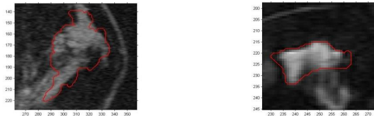
Fig. 1. Examples of a manually segmented malignant (right) and a benign (left) tumor

The images used in this study were provided by the University of Pennsylvania. They were acquired from patients with breast tumors in a 1.5 T scanner (Siemens Sonata) or a 3 T scanner (Siemens Trio). In total, there were 44 subjects used, including 23 malignant and 21 benign cases. All of the samples were histologically verified. The boundary of the suspicious tumors was outlined on the images by a radiologist with expertise in breast imaging. Examples of benign and malignant tumors are shown in Fig. 1.