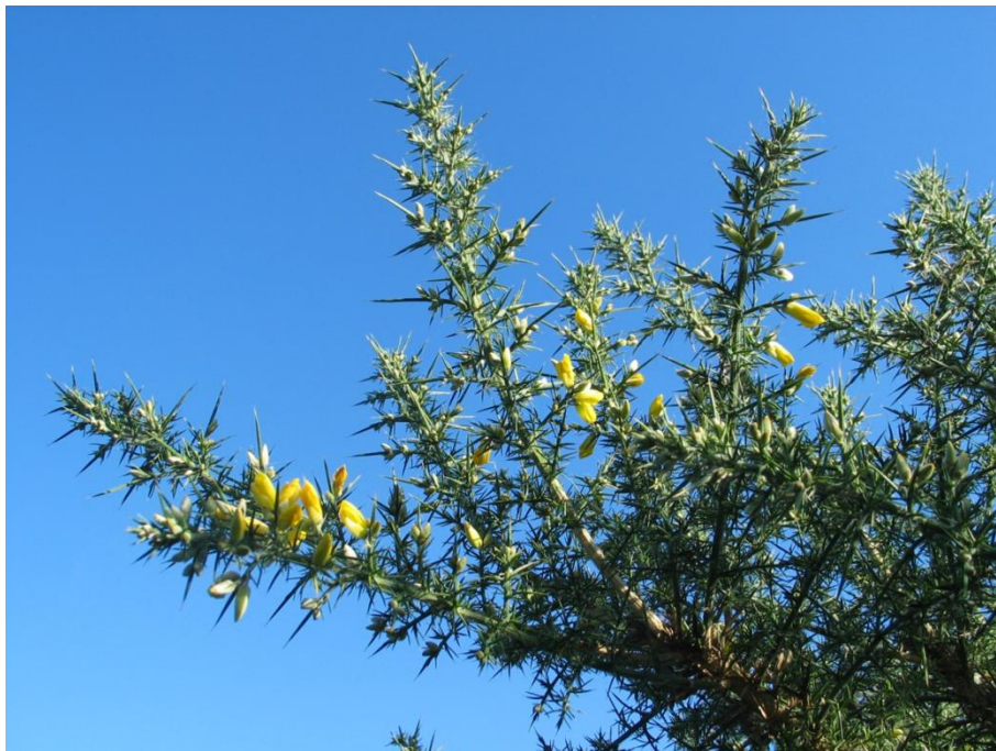
Figure 1.— Gorse ( Ulex europaeus ): a very thorny shrub.

Ulex europaeus , the common gorse, also named furze but hereafter referred to as “gorse”, is a perennial, evergreen thorny shrub (Fig. 1). It is a nitrogen-fixing Fabaceae and is very high in protein. This pioneer species mainly occupies open environments on acidic soils. It reaches its adult height of 1 to 4 metres between the ages of 5 and 7 years. It is also a pyrophilous species: its presence contributes to fires because it is highly flammable, and seed germination is triggered by fire. Its flowering period lasts for a very long time (2 to 10 months) and one single plant can produce tens of thousands of seeds per year, and these seeds can remain viable for more than 20 years (Hill et al. , 2001).