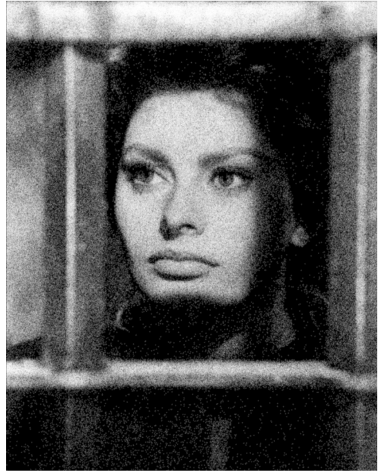
Rendering with triangles