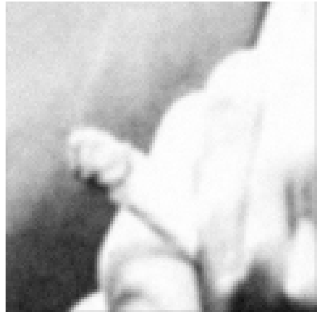
Film grain rendering, zoom : \times 1