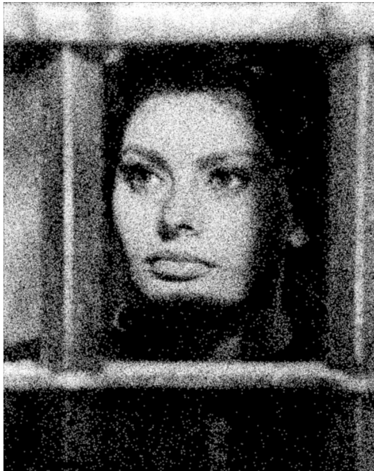
Rendering with disks ( r = 0.2 )