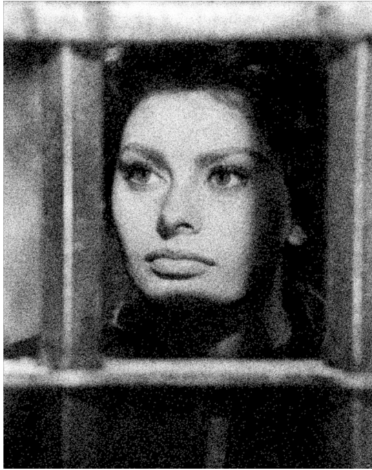
Rendering with disks ( r = 0.1 )