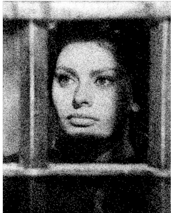
Rendering with triangles