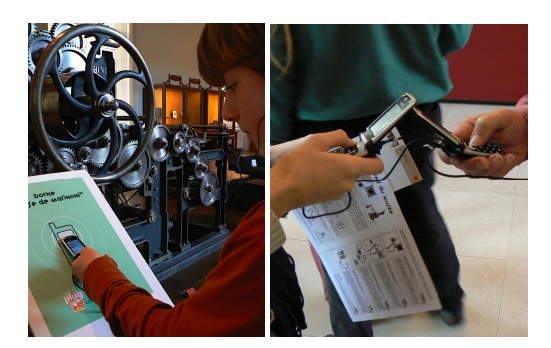
Fig. 1. Experiments in the Museum