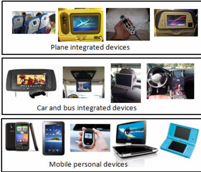
Fig. 2. Learning and playing devices