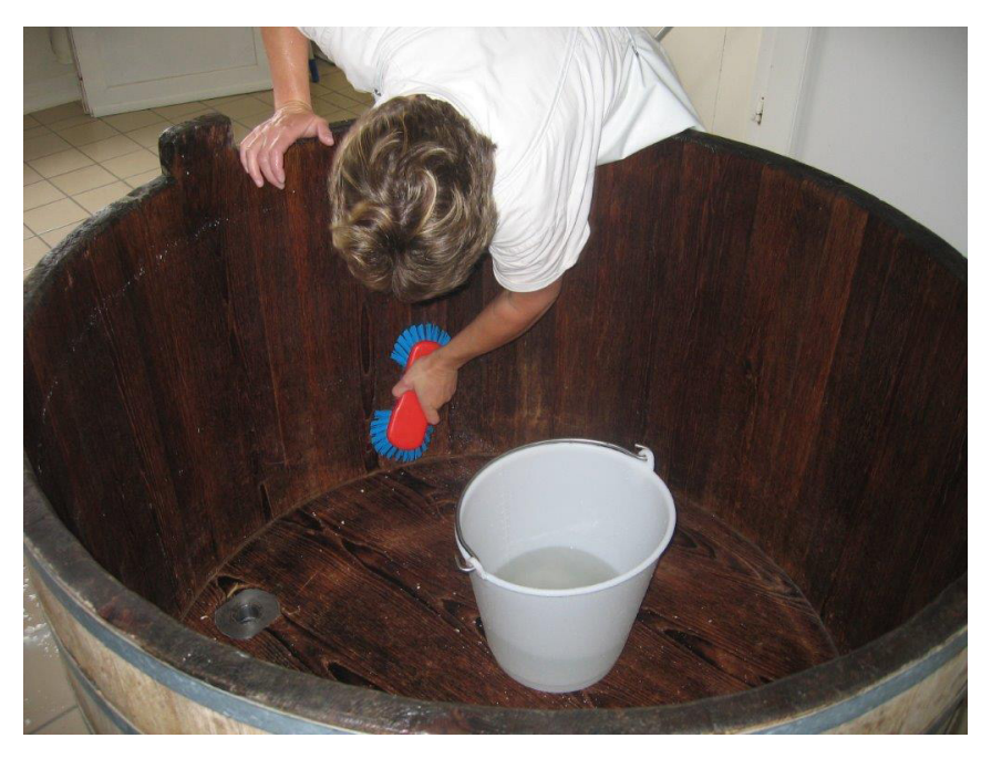
Pното 6. Cleaning the « gerles » in order to respect the microbes for the next cheese fabrication (Caldeyrou Arpajon).

positive and Gram negative yeasts and moulds) that work together for the development of the product's flavour. On the other hand, it is necessary to eliminate pathogenic bacteria to comply with EC regulation (Didienne et al. , 2012).