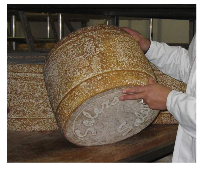
PHOTO 5. Salers cheese ready to be sold, after some months of ripening.

Reinforcing quality initiatives within the context of an industrialized sector created a new and dynamic image for the Cantal cheese industry. Meanwhile, the Salers supply chain seemed backward due to the suspicion surrounding its traditional, free-range practices, based on raw milk and wooden tools. Interestingly, however, research increasingly indicates the benefits of wood (Devoyod et al. , 1987; Mariani et al. , 2007) and raw milk (Michel et al. , 2008). This comparison was made all the more striking by the absence of a structure specific to each PDO. In 2007, 1574 t of Salers cheeses were produced by 86 producers. By contrast,