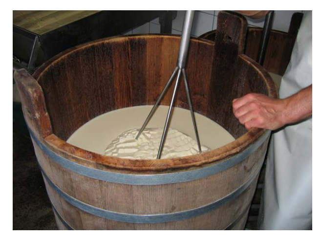
PHOTO 2. The « gerle » in action, with the beginning of decurding.

wiped at regular intervals. Ripening is almost always carried out by third-party ripeners who, like the producers themselves, are diverse. An increasing number are integrated within the supply chain. The most powerful also produce Cantal cheese and does have some influence on Salers cheese making.