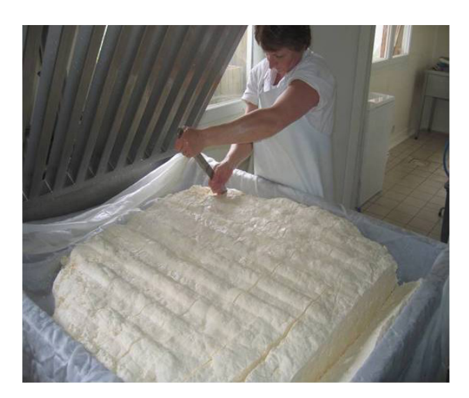
PHOTO 4. Cutting the « tomme » before grinding, salting and stirring.

tion remained more or less unchanged. There are striking contrasts between the two: Cantal pursues productivity-based, large-volume output and low milk pricing; Salers is devoted to low-volume, small-scale production, linked to an image of authenticity and specific character. Salers cheese, until the late 1990s, served to demonstrate how far Cantal production departed from local traditions. But the situation is not as clear as it seems. In the same period, the Cantal sector underwent significant development with careful consideration being given to its quality objectives. The Cantal PDO had serious problems with very low mass-market cheese prices, which in turn depressed the price of local milk to below the national average. The Cantal PDO board therefore tried to modify the rules, looking to raise the perceived status of its cheese by raising the quality.