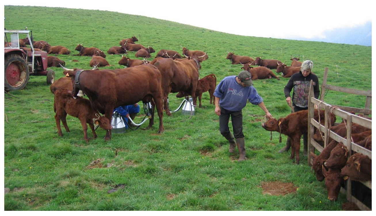
Photo 1. Open-air milking a herd of cows belonging to the Salers breed, with the presence of the calves.