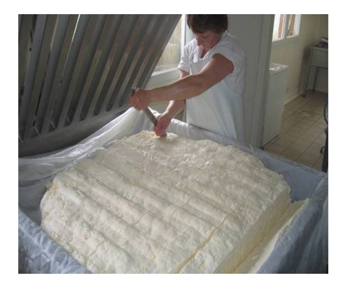
Photo 4. Cutting the « tomme » before grinding, salting and stirring.