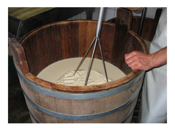
Photo 2. The « gerle » in action, with the beginning of decurding.

wiped at regular intervals. Ripening is almost always carried out by third-party ripeners who, like the producers themselves, are diverse. An increasing number are integrated within the supply chain. The most powerful also produce Cantal cheese and does have some influence on Salers cheese making.