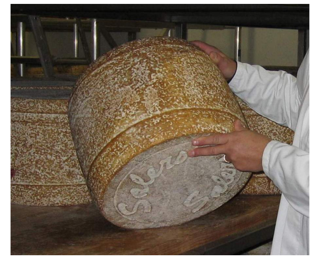
Photo 5. Salers cheese ready to be sold, after some months of ripening.

tion remained more or less unchanged. There are striking contrasts between the two: Cantal pursues productivity-based, large-volume output and low milk pricing; Salers is devoted to low-volume, small-scale production, linked to an image of authenticity and specific character. Salers cheese, until the late 1990s, served to demonstrate how far Cantal production departed from local traditions. But the situation is not as clear as it seems. In the same period, the Cantal sector underwent significant development with careful consideration being given to its quality objectives. The Cantal PDO had serious problems with very low mass-market cheese prices, which in turn depressed the price of local milk to below the national average. The Cantal PDO board therefore tried to modify the rules, looking to raise the perceived status of its cheese by raising the quality.