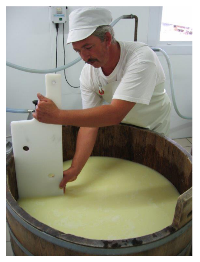
Рното 3. The curd is gathered in the gerle (Gaec des Coches).

Throughout its 40-year existence, the Salers sector has thus maintained traditions that its powerful neighbour has discarded. The two sides went their separate ways, Cantal production evolving while Salers produc-