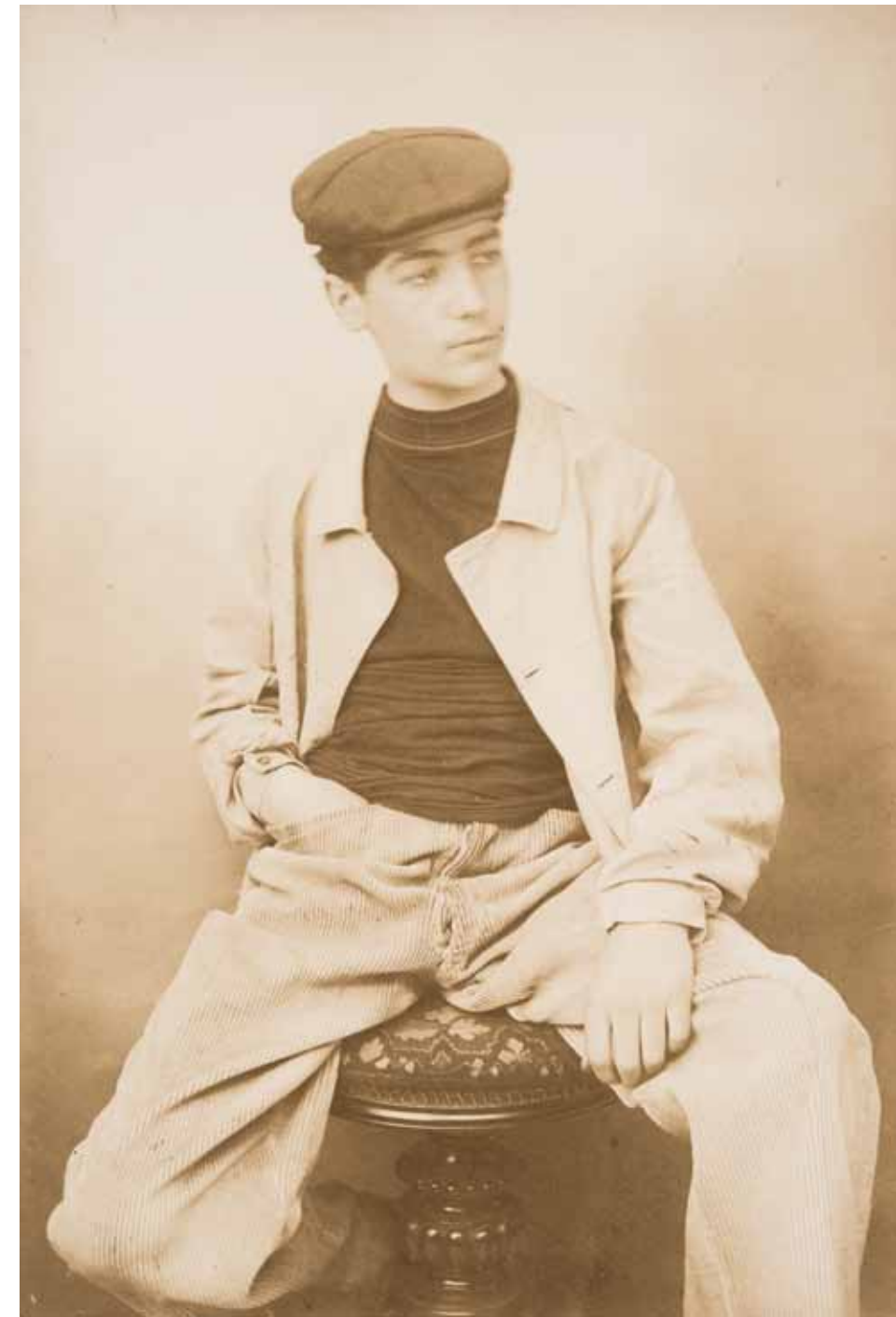
439. E. Ruppert, Pimp , c.1900, aristotype, 6 ¾ × 4 ¼ in., Paris, Nicole Canet, Galerie Au Bonheur du Jour

11 Alain Corbin, Les Filles de nocé: misère sexuelle et prostitution au XIX e siècle , Paris, Flammarion, ‘Champs’ series, 1982 (1st edn 1978), pp. 315–79.