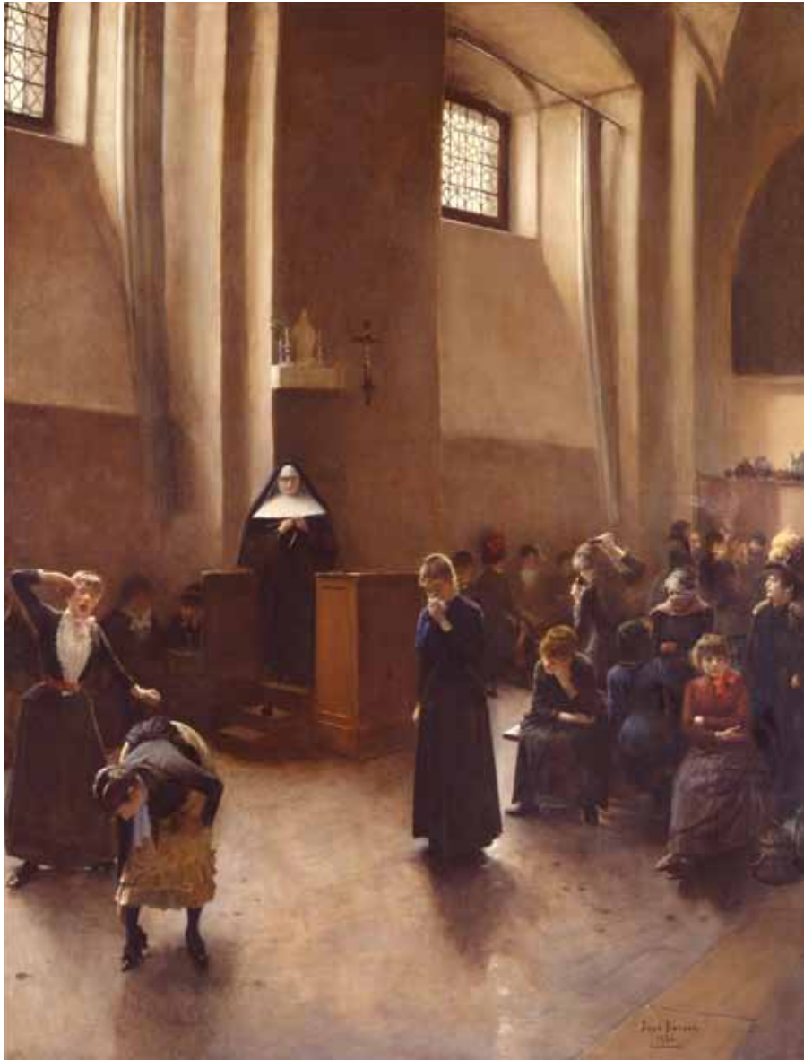
190. Jean Béraud, Prostitutes' Charge Room at the Police Headquarters , 1886, oil on canvas, 56 3/4 x 45 1/2 in., Texas, private collection