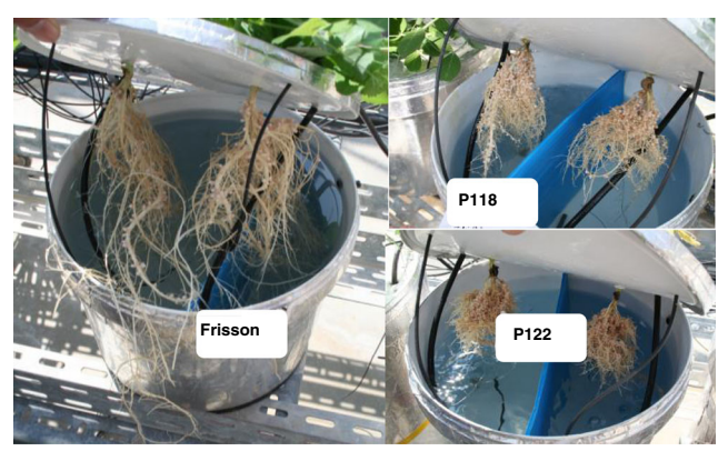
Fig. 1 Nodulated roots of the genotypes Frisson, and P118 and P122 hypernodulating mutants, as grown in hydroponics in our greenhouse experiment

by bubbling air in each pot compartment. The air flow was calibrated so that oxygenation was always close to 100 % of its maximal value (LDO sensor, Hatch Lange). Plants were inoculated with the N<sub>2</sub>-fixing bacteria R. leguminosarum bv. Viciae P221 (MIAE01212) with a concentration of 10^8 colony forming units per plant. This strain was obtained from "Microorganismes d'intérêt Agroenvironnemental" located at UMR Agroécologie, INRA, Dijon, France. The inoculum was prepared from cultures grown on Bergersen slopes washed with sterile water. The pH of the nutrient solution was controlled and maintained between 6.5 and 7.5, which enables Rhizobia to survive freely in solution and to efficiently nodulate pea plants (Amarger, personal communication). The nutrient solution was totally renewed and re-inoculated every 2 weeks.