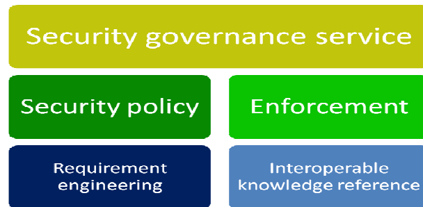
Fig. 1. Framework overview.

The foundation of our framework (see fig. 1) includes a collaboration-oriented security requirements engineering method and a domain knowledge base to define partners' security policies and profiles with. Coupled with a negotiation strategy between the policies and profiles, as well as enforcement of decisions, end-to-end protection for assets can be achieved.