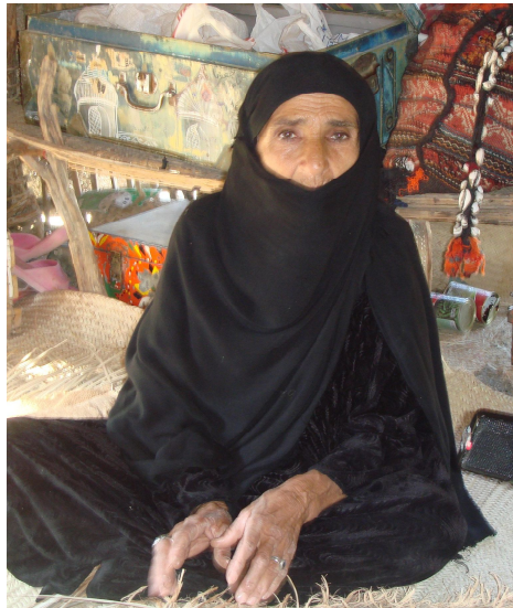
Above: a Bashkardi woman interviewed at home.