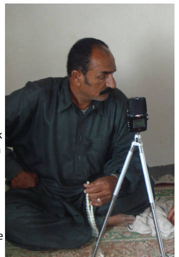
Above: Bashkardi interviewees.

It is perhaps these difficulties that have contributed to Bashkardi being so little-studied. While some work has been done in more recent years on the somewhat more accessible varieties spoken on or close to the coast, the dialects spoken