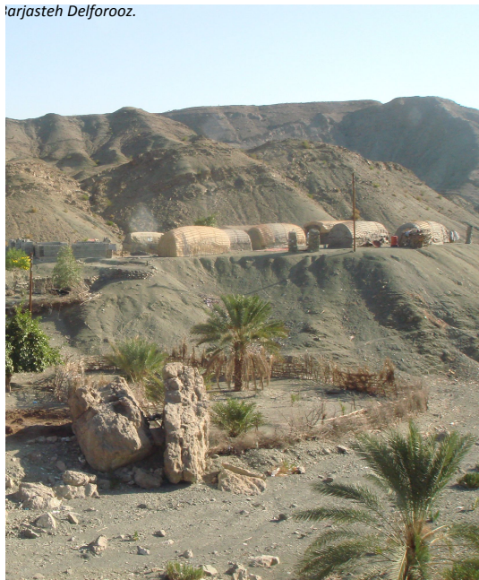
Behrooz Barjasteh Delforoos.

scholarly journal or book to this day, nor is there any grammar beyond short handbook overviews.