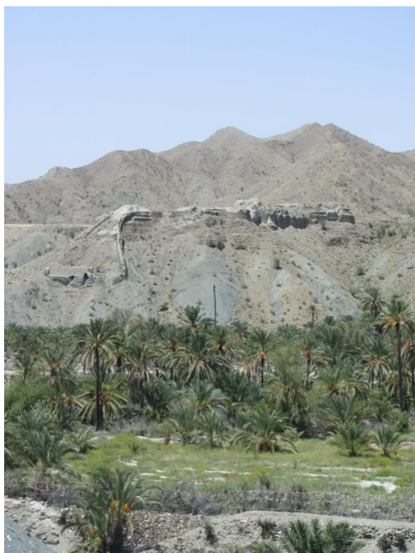
Above: Ancient fortress in Bashkerd.

In the course of this year, I will concentrate further on the Bashkardi project by way of a prolonged stay in Cambridge where I am currently a Visiting Fellow of Clare Hall.