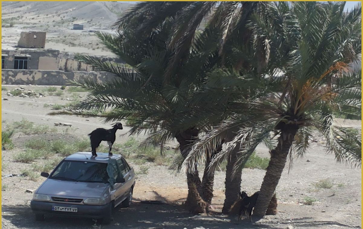
Above: Bashkardi landscape.