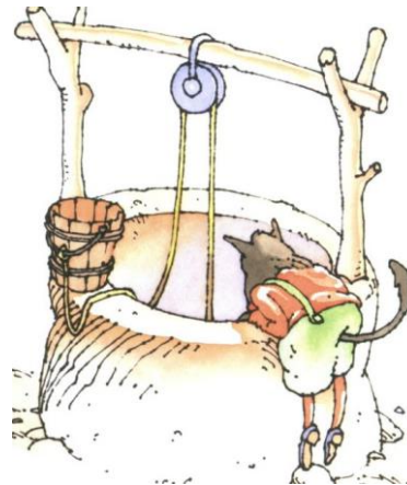
Fig.2: Plouf! well and pulley device

The sequence then brings children to conceive and build a real-world well-and-pulley device. First, the teacher proposes activities to help pupils to establish the analogy between the book's device and the ones they are going to build. Once it is operational, they are asked to reproduce the different steps of the story, using bottles of various weights with glued images of the imaginary animals on it (Fig. 3). The last step of the story proves impossible to reproduce, since the previous ones imply that the wolf-bottle is lighter than the "rabbits" one [1].