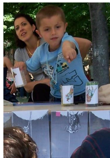
Fig.4: 5 years old hosting a science event: You try it!