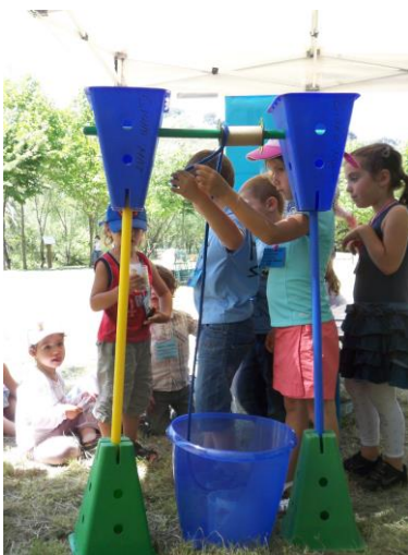
Fig. 3: Real-world well-and-pulley device

Exchanges among children and with the teacher yield an emphasis on the difference between what happens in the story and with the real-world device. The contradiction is then discussed in the group of children and with the teacher. The children's propositions around it (changing the weight of animals etc.) are implemented. The sequence is eventually re-done and different kind of well-and-pulley devices proposed, with a back and forth alternation between the story and the real-world devices, between prediction of behaviours and their experimental verification.